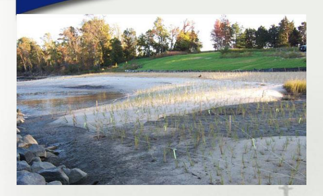
After (nearly the same orientation as the Before photo): The CAX Site 1 shoreline following the remedial action. The slope is now gently rolling and there is a wide, sandy beach along the shoreline.

In another partnership with FWS, the team created a quarter-acre ephemeral pond at a former burn pad residue disposal area where 57,000 tons of soil and debris were removed. Numerous native plants were introduced at the site, including wetland and upland species, thus providing valuable habitat for amphibians and reptiles. Land use controls became unnecessary after the remedial action was completed.