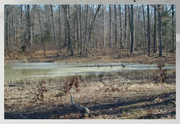
As part of the WPNSTA Yorktown Site 4 restoration, a wetland area and pond was incorporated into the final grading. The success of the Site 4 cleanup demonstrates WPNSTA Yorktown's commitment to partnerships and environmental restoration.

In another partnership with FWS, the team created a quarter-acre ephemeral pond at a former burn pad residue disposal area where 57,000 tons of soil and debris were removed. Numerous native plants were introduced at the site, including wetland and upland species, thus providing valuable habitat for amphibians and reptiles. Land use controls became unnecessary after the remedial action was completed.