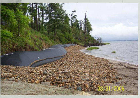
Protection of the environment continues with the installation of Geotubes at CAX Site 7. The Geotubes protect the York River from debris sloughing. A debris and contaminated soil removal action in Fiscal Year 2008 will protect human and ecological receptors from potential risks.

The NERP at WPNSTA Yorktown and CAX is an example of what can be accomplished when the military works as partners with regulators and community members to support military readiness and ensure protection of human health and the environment.