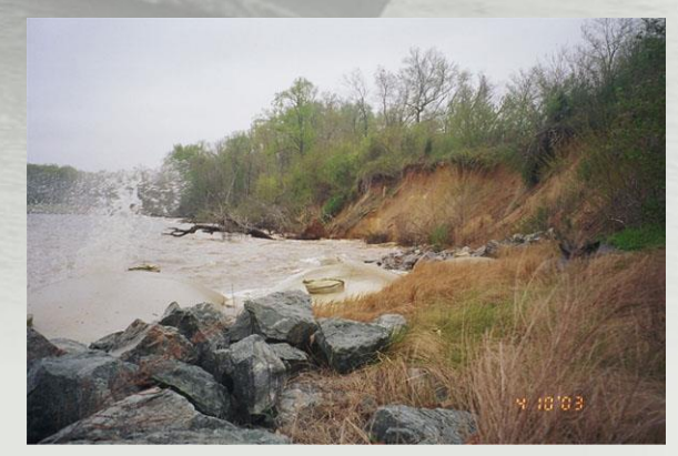
Before: The CAX Site 1 shoreline prior to start of the removal action. Note the steep elevation from the top of the landfill to the shoreline.