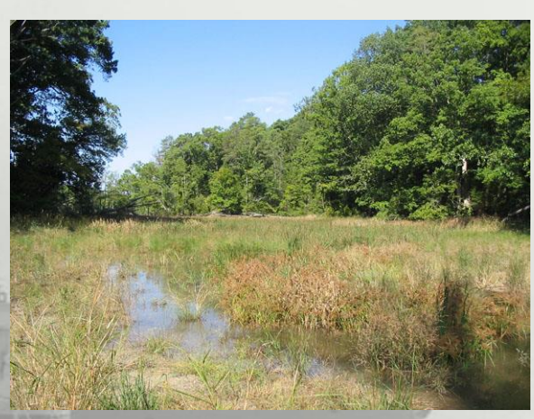
The WPNSTA Yorktown Site 6 Impoundment Area following restoration. The restored wetland with riparian buffer provides excellent ecologic habitat.

a significant contaminant mass reduction of 99.9992 percent. By choosing treatment over excavation and landfill disposal, the Navy removed significant contamination (50.44 tons of explosives) from the environment and reduced restoration costs by achieving residential cleanup goals and eliminating the need for land use controls at the site. In addition, through optimization of the treatment process, there was a cost avoidance of $310,024.