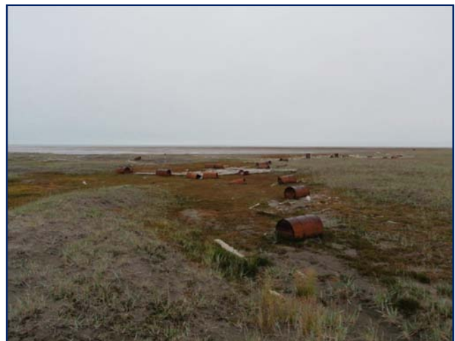
Photo 2. Numerous drums were deposited in the Jago River delta by storm events. Over 1,400 drums were located and removed from the river delta. This removal action helped to eliminate any future releases of petroleum product into the Arctic Ocean.

The Project Delivery Team was tasked with the mission of implementing the FUDS program for Manning Point. The DERP goals are to reduce risk to human health and the environment through implementation of effective, legally compliant, and cost-effective response actions. The FUDS program requires projects to progress to various stages by specific dates (i.e., milestones).