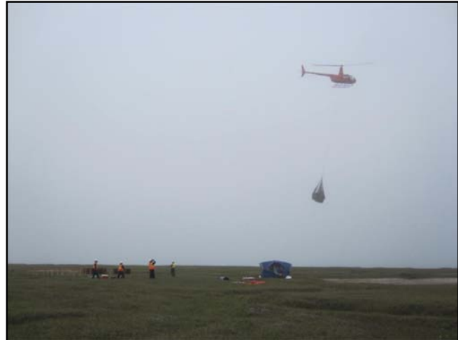
Photo 6. Workers from Marsh Creek and Weston Solutions observe a sling load of 8-10 drums being transported by a Pollux Aviation R-44 helicopter to Kaktovik, Alaska.

deal with the increase in quantity. For a solid week, two helicopters were used to sling loads of drums that were retrieved from the sand bars (see Photo 6). Also, the front-end loader that the contractor was renting from a local contractor broke down. The contractor had to quickly obtain another front-loader in Prudhoe Bay and ship it to Kaktovik on the next available barge.