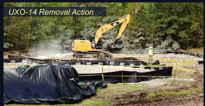
UXO-14 Removal Action