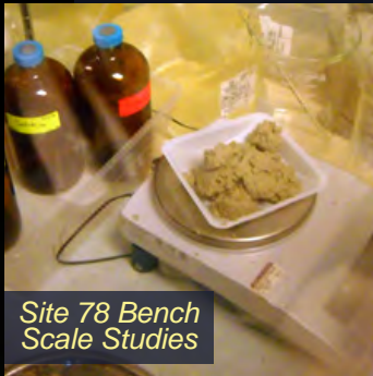
Site 78 Bench Scale Studies

over time demonstrating a decrease in the pump and treat system's effectiveness to remove contaminant mass from the impacted groundwater and recommended evaluation of alternative treatment technologies. As a result, a target treatment area with total chlorinated VOC concentrations over 10,000 parts per billion (ppb) was identified for a series of bench scale studies to evaluate the effectiveness of in situ treatment as a potential method to accelerate site closure. Several bench scale studies