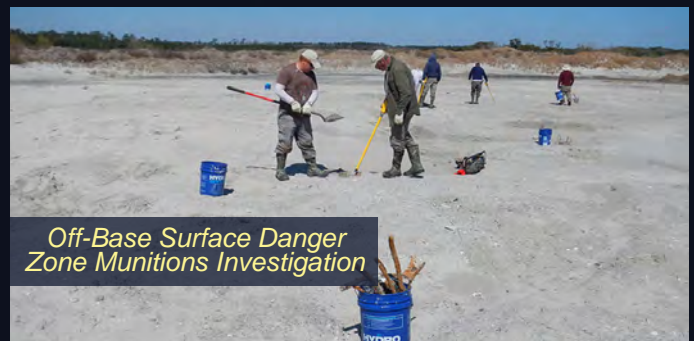
Off-Base Surface Danger Zone Munitions Investigation