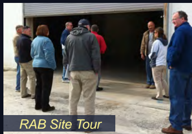
RAB Site Tour