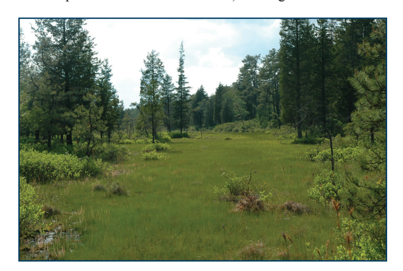
WGR was the first ANG base to successfully utilize REPI funds to purchase land bordering the Range. This purchase was included in the 2013 7th Annual Report to Congress. WGR not only reduced encroachment but ensured that beautiful wetlands like the one above will continue to be preserved.

Wetlands on WGR host a significant biodiversity of flora and fauna, including numerous TERS. Research indicates that one of the most important factors for rare plants such as the federally-endangered swamp pink (found adjacent to WGR) and the state-listed bog asphodel is the maintenance of natural hydrology and water quality. In 2012, bog asphodel was delisted by the USFWS as a federal-candidate species. Although currently found only in NJ, the USFWS utilized data from a monitoring study on WGR to make a "not warranted for listing" determination. The 2011 INRMP has several task orders related to periodic surveys and continued monitoring of water resources and in 2013 the LPRDU developed a SOW to update the wetlands and water quality data. WGR used wetland delineation data over the last several years to install 11 critical habitat wetland crossings to prohibit erosion/sedimentation and preserve hydrology at no cost ('no cost' because additional work is performed outside the SOW) to the government.