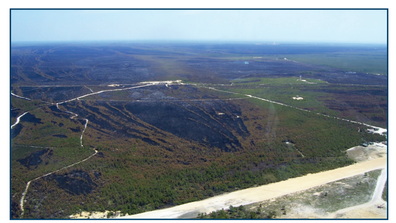
WGR prescribed burned 5,100 acres last year in one of its largest and most intense burns to date to lower hazardous fuel loads. Following burning, the flowering populations of the federally-threatened Knieskern's beaked rush increased 1900 percent and those of the Pinelands-protected pine barrens gentian increased by 136 percent. Visitors to WGR learn about the important role these fires play in maintaining the natural Pinelands ecosystem.

WGR is located in the heart of the New Jersey (NJ) Pinelands, the largest body of open space along the mid-Atlantic coast between Richmond and Boston. The NJ Pinelands comprises 1.1 million acres and is home to one of the largest fire-maintained dwarf pine plains forests in the world. WGR encompasses approximately 9,416 acres. Approximately 550 of those acres, located in the east and central portion of the Range, are designated for tactical and conventional air-to-ground gunnery training (target zone). The target zone is surrounded by 8,864 acres of undeveloped land that is managed and protected as a safety buffer.