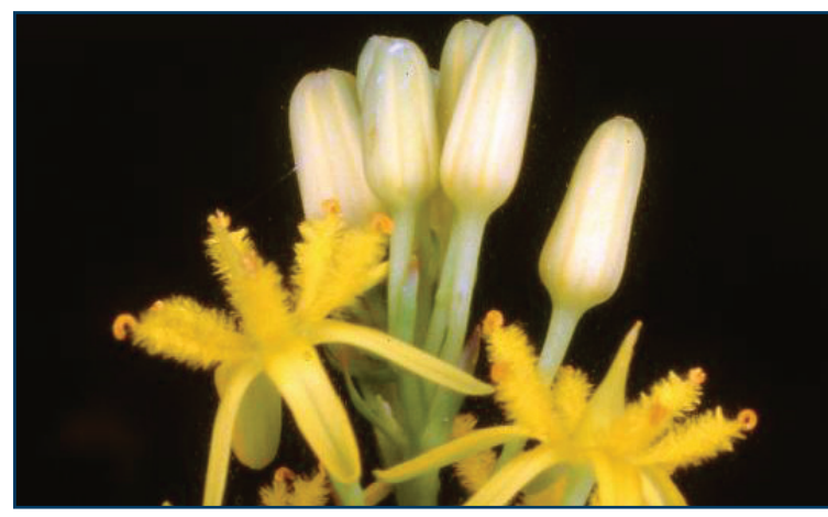
WGR has successfully managed the 37 TER plant species found on the Range. A rare plant study conducted on WGR which provided preliminary data on bog asphodel (above) pollination ecology was part of the documentation used by the USFWS in making its determination that this federal-candidate species was not warranted for listing.

CFS identified over 300 species of plants, including two federally-listed species (one candidate species has since been delisted), 27 state-threatened and endangered species and five globally rare habitats (out of 25 habitat types). WGR partnered with the LPRDU to develop a novel adaptive management protocol for vegetation regrowth on highly disturbed military lands and a simple model to quickly determine factors promoting invasive species in order to prevent their spread on WGR. Over the past 20 years WGR has restored 27 sites, consisting of 19 unique reclamation projects, including revegetation of old Range sight lines. WGR coordinated with the LPRDU to create a herbarium with over 120 plant species and sent voucher specimens to the Academy of Natural Sciences in Pennsylvania.