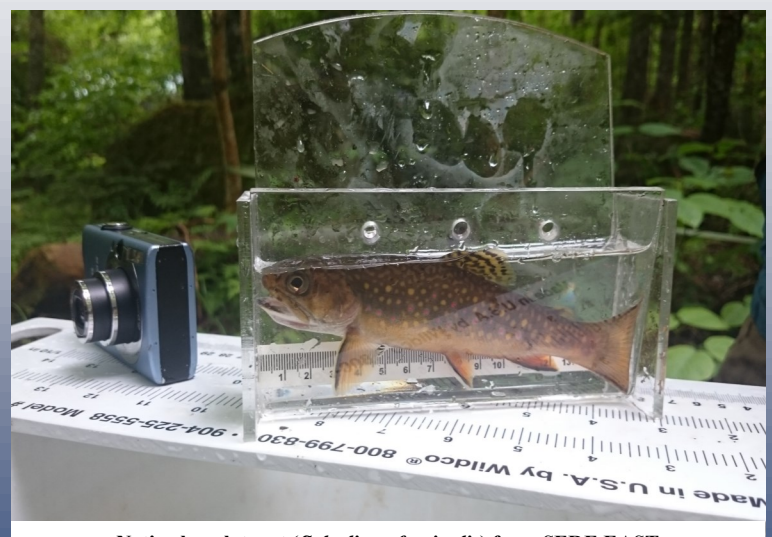
Native brook trout (Salvelinus fontinalis) from SERE EAST

habitat in the heart of the Maine High Peaks Wilderness Area, a major benefit to the local community. The essential fish and wildlife surveys have led to an increased knowledge base on significant wildlife resources at the installations and thus, have supported improved conservation measures for public trust wildlife species. Mr. Trefry's education and outreach activities throughout the PWD-ME AOR increased general awareness of sensitive habitats and significant wildlife species present at installations. Mr. Trefry's significant achievements enhanced environmental stewardship and benefitted the overall mission throughout the PWD-ME AOR through his assistance with facility projects, recreational activities, and critical mission execution.