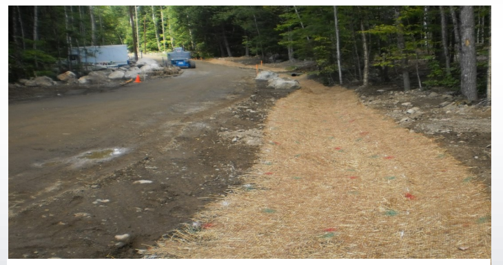
Road and drainage repairs at GPOAC. GPOAC is located within the Atlantic salmon watershed.

resources projects focusing on erosion control monitoring major forest management initiative in which Mr. Trefry and remediation at three installations within Atlantic played a key role is the Readiness and Environmental salmon watersheds. These projects are focused on main- Protection Integration (REPI) Program now providing taining installation exemptions from the ESA critical hab- conservation easements on 9,728 acres bordering the itat designation. The Maine installations are fairly remote northern boundary of SERE EAST. This partnership with with unimproved roads and drainage systems that could Trust for Public Land and Maine Appalachian Trail Land negatively impact Atlantic salmon waters. Mr. Trefry ef- Trust preserves wilderness that maintains a realistic, refectively identified resource impact concerns and collabo- mote environment for SERE EAST field training and rated with the Public Works managers to properly remedy buffers the installation from encroachment. The REPI erosion control issues, which could also impact mission will provide timber harvesting and wildlife habitat on the execution by limiting base accessibility. Mr. Trefry also bordering parcel, a land use scheme that is compatible provided periodic training to Public Works personnel on with the current installation mission. Mr. Trefry's extenthe maintenance of sediment and erosion controls, en- sive knowledge of the area's natural resources assisted in