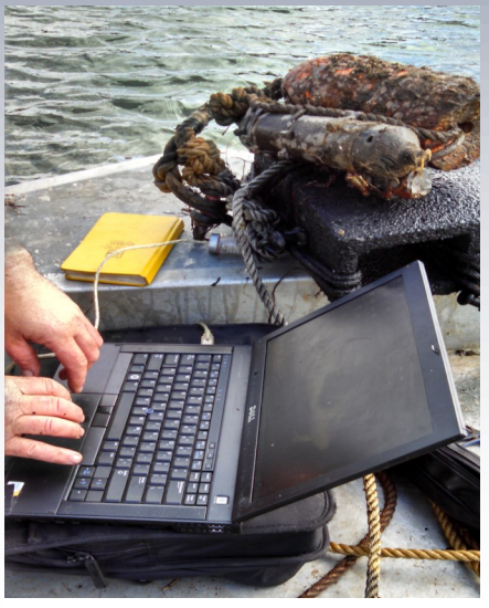
Atlantic sturgeon monitoring equipment.

Maine. and may ultimately assist in the Critical Habitat determination for the Piscataqua River.