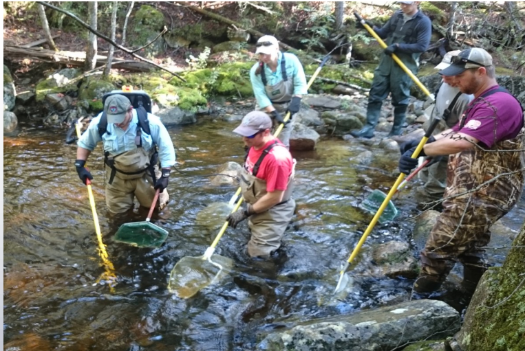
Electrofishing survey for Atlantic salmon at SERE EAST. A collaborative effort between NAVFAC PWD-ME, NAVFAC MIDLANT, Navy Contractor, Maine IF&W, and USFW

life Service (USFWS) noted that the INRMP was noticea- Atlantic salmon. A series of electrofishing, gill net, and bly deficient in addressing the installation's Migratory trap sampling methods were used at each installation to Bird Treaty Act requirements. Cutler has been identified complete baseline fish surveys and to monitor for salmon as an Important Bird Area by the Institute for Bird Popu- presence on the installations. This was a collaborative lations, and avian radar data collected in 2013 document- effort between the Navy, Maine DIF&W, and USFWS. ed one of the largest migration totals ever recorded in the During this effort, Maine DIF&W provided six fisheries with communication towers. To obtain legitimate data, 30 tion 10 permit for any potential take of salmon that may percent of the identified hazard area (1,800-acre VLF occur during the survey. Even though no salmon were tower field) was surveyed over the course of peak spring captured, the results of the surveys continued to support and fall migration periods at five weeks per season. A the ESA Critical Habitat Exemption for the installations total of 40 five-acre plots (200 acres total) required recon- and honor the Navy's agreements with its Sikes Act part-