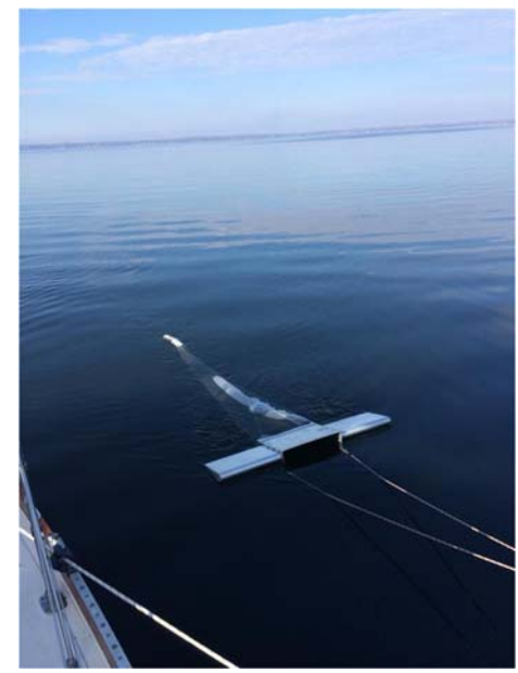
The trash trawl net is 330 microns in size, and will catch everything but water, Photo Credit; Julie Lawson

What can installations do about this alarming fact? For starters, get your installation community involved with trash clean up events regularly. These are usually free to host and require little coordination and volunteer time. Also, get your coworkers to watch this two-minute video on the introduction of microbeads; it may change the way they think about the products they use! <a href="http://storyofstuff.org/movies/lets-ban-the-bead/">http://storyofstuff.org/movies/lets-ban-the-bead/</a>