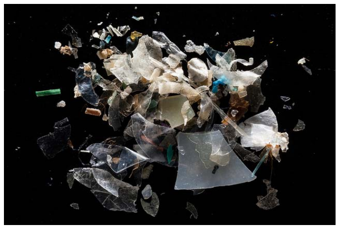
Microplastics from the Rhode River, a tributary of the Chesapeake Bay.

In a partnership with the 5 Gyres Institute, Trash Free Maryland took to the Chesapeake Bay in November to study the presence of microplastics in the water. Setting out from Deale, MD, the research team collected seven samples by dragging a trawl for an hour at a time. The trawl was fitted with a cone-shaped net, whose holes measure 330 microns wide, about the width of 2-3 strands of human hair. Water flows through the main opening and the fine mesh of the net ensures anything suspended in the water is trapped behind.