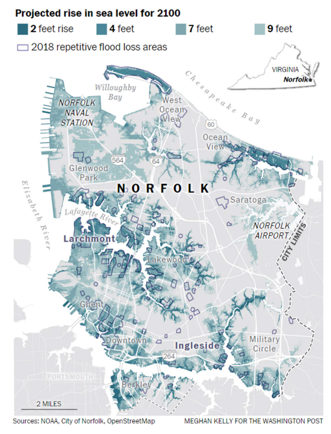
Figure 1 – Areas impacted under different sea level rise scenarios in Norfolk, VA.

At NSN, the Union of Concerned Scientist study estimates an increase of 1.4 to 2.0 feet in sea level rise by 2050<sup>1</sup>. Persistent flooding caused by increasing sea level, annual precipitation, and storm intensity can pose a risk to the local economy, public health, and military readiness (Figure 1). Flooded buildings, disrupted transportation, and lack of access to or suitability of training areas may also negatively impact operations at military installations. These problems will only worsen if current trends continue or if more extreme scenarios are realized. For example, in Hampton Roads, 1.7 days of sunny day flooding were observed in 1960 compared to 7 days in 2014. By 2100, sunny day flooding could become