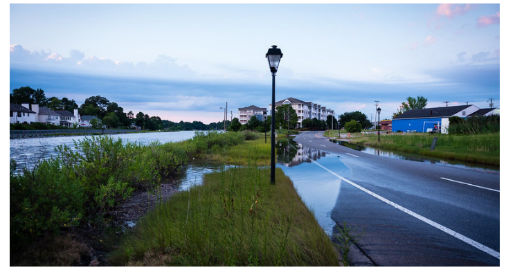
Flooding due to sea level rise in Norfolk, VA.

REPI Program . New development can compound existing flooding risks. Land conservation removes this negative pressure and preserves natural areas that may attenuate floodwaters. In 201