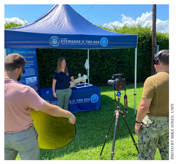
SoTS conducted virtual outreach to keep the public engaged and informed during COVID-19.