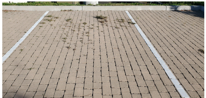
Permeable pavers with weeds growing between the individual pavers. The space between some pavers is clogged with sediment.