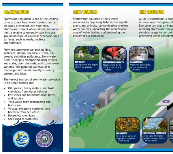
NSN distributed informational materials to installation tenants via e-mail due to canceled in-person events.

The U.S. Fleet Forces Command (USFF) Stewards of the Sea (SoTS) team is conducting an organization-wide effort to adapt its robust public outreach and education program to ensure it can continue to safely reach audiences. Planning for the SoTS 2020 outreach season at USFF began like previous years: scheduling outreach events, coordinating travel plans, and identifying staff to operate the exhibits during events. The outlook for the year was promising with a focus on educating regulators and the public with Navy environmental messaging. When the pandemic hit, planned in-person events were canceled or moved to a digital format. Live virtual and online media became the primary focus of SoTS outreach efforts. The Navy Office of Community Outreach also pivoted to virtual events for the 2020 outreach season, which allowed SoTS to share existing videos and materials during Virtual Navy Weeks. Using USFF public affairs staff for scripting, videotaping, and editing, SoTS produced educational videos for specific events such as the NAS Oceana STEM Day and Tri Cities (Bristol, TN) Navy Week. To allow the videos to be used at multiple events, both now and in the near future, the team focused on creating videos that do not discuss specific outreach events (e.g., Fleet Week New York) or the time of the year. USFF videos can be viewed on their YouTube page at www.youtube.com/ usnavystewardsofthesea