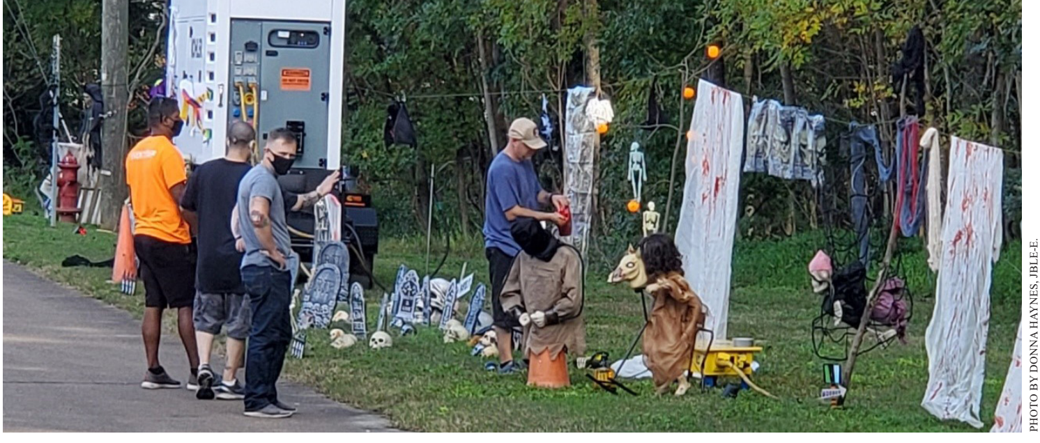
Volunteers set up a ghoulish display for cars to drive past at the JBLE-E Trunk-or-Treat event.