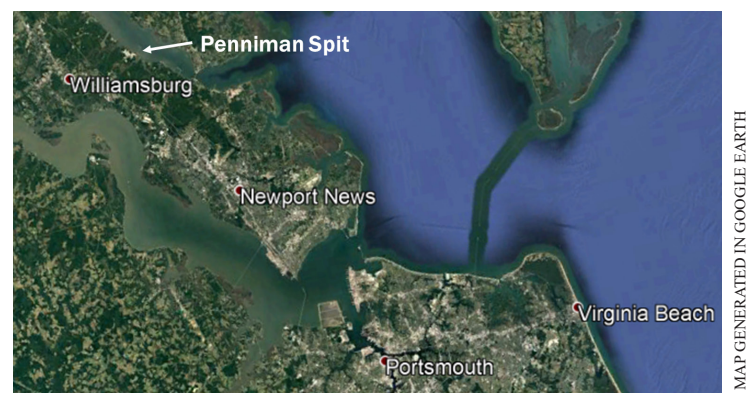
Penniman Spit is located on the south shore of the York River at NWS Yorktown.

For more information about the goals of the REPI Program or to learn more about how to join the program, please visit https://www.repi.mil/Resources/Primers/.