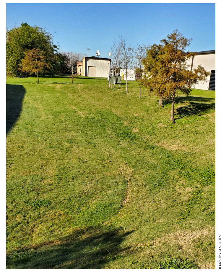
This BMP is properly mowed and maintained and in good condition

NSN successfully developed a program through contracting and collaboration with installation Environmental and Public Works staff to address the challenges in maintaining BMPs. This success serves as an example that other installations may follow as they implement a BMP maintenance program. NSN's BMP maintenance solutions include two primary strategies, which are described on the next page.