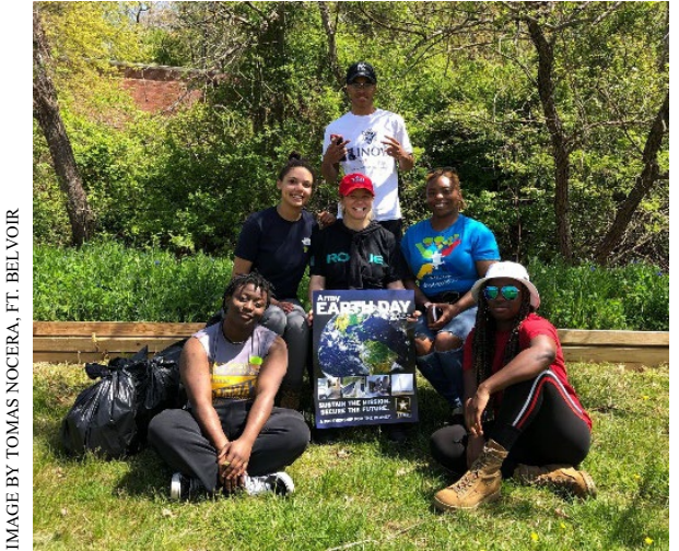
Employees of the Public Health Food Inspection Section of Fort Belvoir winning the Spring-Cleaning Competition.

The Directorate of Public Works Environmental Division at Fort Belvoir strives to create a culture of taking care of their lands and waters by fostering environmental stewardship throughout its community. In honor of Earth Day, celebrated each April, natural resource and environmental specialists hosted numerous events to empower military members and their families, DoD civilian personnel and members of the surrounding defense community to take care of where they live and teach them about the sensitivity and resiliency of our environment. These events included celebrating the 34th annual Potomac Watershed Cleanup with the Alice Ferguson Foundation, celebrating Earth Day 2022, and hosting Cub Scout Pack #118 for a Clean the Bay cleanup event.