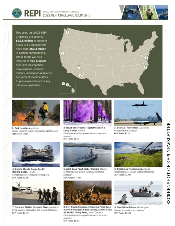
2022 REPI Challenge Recipients.

The 2023 REPI Challenge will focus on climate resilience, incompatible development, and habitat restoration, with up to $40M available in funding opportunities. $25M will be allocated to projects that apply through the REPI Challenge process and up to $15 M will be allocated to projects that apply through the National Fish and Wildlife Foundation's National Coastal Resilience Fund. The deadline for pre-proposals has already passed, however all pre-proposal applicants will be notified regarding the status of the pre-proposal. DoD will announce 2023 REPI Challenge recipients sometime in December 2022 or January 2023.