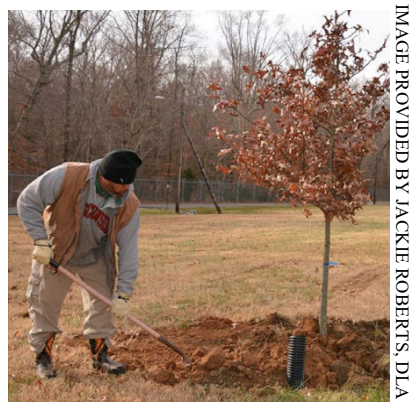
DSCR staff engaged in tree planting.

In its most recent effort DSCR planted 50 trees native to Virginia across the installation. The trees, mostly planted near the East Gate entrance and southeast perimeter are a mix of columnar oaks, red oaks, red maples, and dogwoods. The suite of native trees was specifically selected for their environmental attributes and installed to connect woodlands, create wildlife