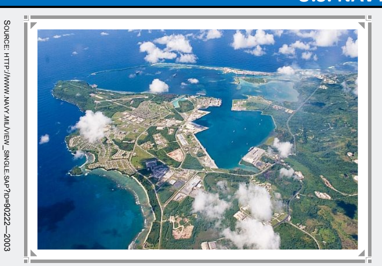
Apra Harbor and Orote Navy Base and Air Strip

During WWII and throughout the Cold War, U.S. Naval Forces Marianas was responsible for all U.S. Navy missions and activities on Guam, the Commonwealth of Northern Mariana Islands, and the western Pacific Ocean. In Guam, Cold War naval functions included the: (1) former Naval Station, which included the Navy Supply Depot (later Fuel Industrial and Supply Center), Naval Supply Depot, waterfront facilities and harbor, Public Works Center, and housing; (2) former Naval Magazine; (3) former Naval Communications Station Finegayan; (4) Naval Hospital; (5) former Camp Covington; (6) Naval Facility; and (6) former Naval Air Station (NAS) Agana.