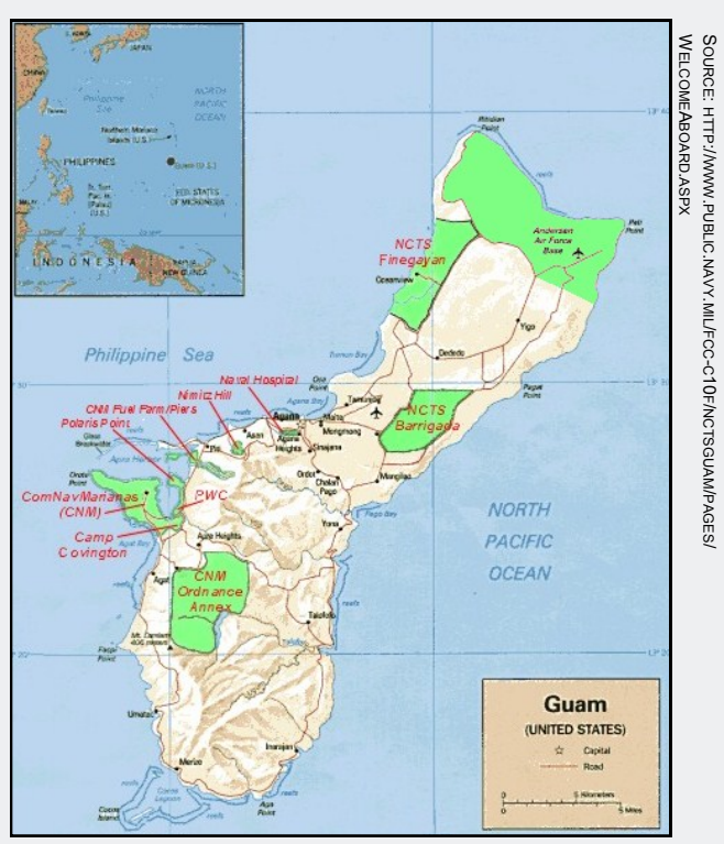
Map of Military Installations on Guam

In the final months of World War II, the U.S. Navy had built its largest advanced base on Guam, which supplied material support for more than one-third of U.S. Navy power. Five years of peace following World War II ended on 25 June 1950 when North Korean troops attacked South Korea. Approximately a decade later, the U.S. military was again deployed in Southeast Asia—this time in Vietnam. During the post-Vietnam period and throughout the 1980s, military installations on Guam and the Northern Mariana Islands remained vital overseas platforms for carrying out the U.S. mission of global nuclear deterrence. These events kept Guam on the front lines throughout the Cold War.