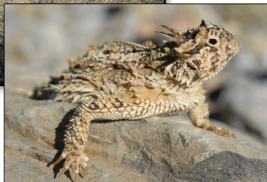
The Monument Proclamation calls for protection of Texas horned lizards on the Monument.