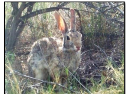
Desert cottontails regulate body temperature by resting in shaded areas during peak heat and using their large ears to release excess heat.

The Monument Proclamation directs the Army to protect historic, scientific, natural, and cultural resources and values of the area. These include significant archaeological and paleontological resources; rare and fragile natural resources, unique geological features; and sites of cultural significance to Tribal Nations for the benefit of all Americans. It requires the Army to expeditiously execute military munitions response actions in accordance with required cleanup processes and allows for the potential phased opening of the Monument for public access once conditions necessary to protect visitors' health and safety are met.