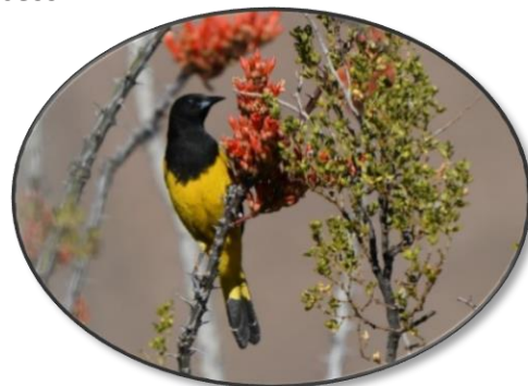
Scott's orioles migrate to the southwestern United States during the summer nesting season.

Due to the complexity and magnitude of the cleanup, it will be years before the Monument will be safe for public access.