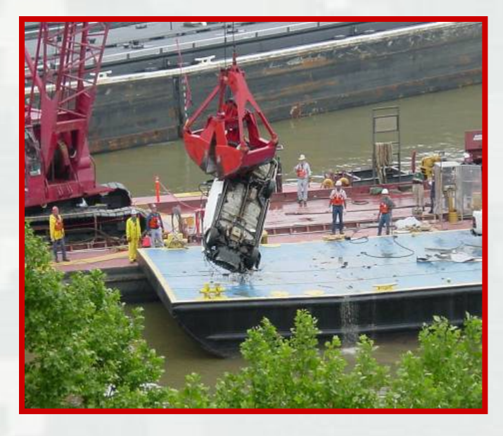
2002 – SWD CISM Initiation First Activation May 2002, I 40-Bridge Incident, AR