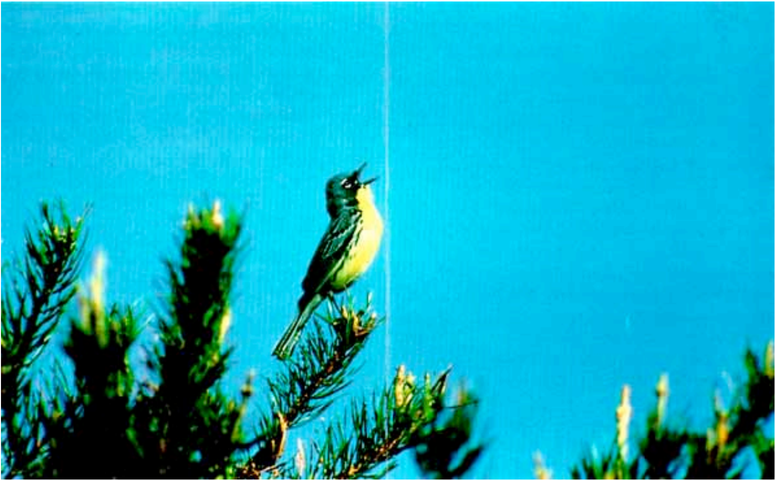
Kirtland's Warbler ( Dendroica kirtlandii )