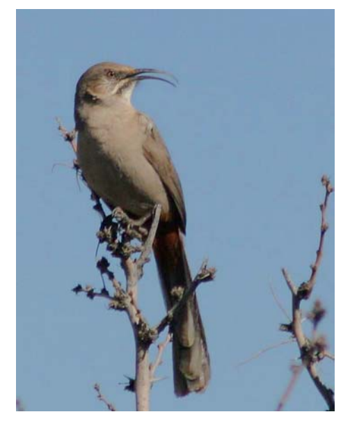
Crissal Thrasher, a PIF Species of Continental Importance in the Southwest Avifaunal Biome.

The Legacy Resource Management Program 2006 Technical Notes featured the DoD PIF program as a significant Legacy-funded project. One of the major contributions of DoD PIF to the Legacy program is the review process to evaluate all pre-proposal and full proposal submissions to the annual Legacy funding cycle. The network of DoD PIF Reps reviewed an average of 24 bird-related pre-proposals to see if each one meets required criteria to warrant a full proposal submission. An average of 13 full proposals each year were then reviewed in detail and scored in each of 10 criteria developed by the DoD PIF Program. The sum of these scores was presented as a