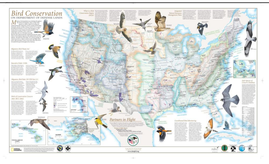
Bird Conservation on DoD Lands map (hard copies available on request).

ranking to the Legacy review committee. Legacy funding for bird conservation projects has now exceeded $27 million, and also provides the funding for program management of the DoD PIF program.