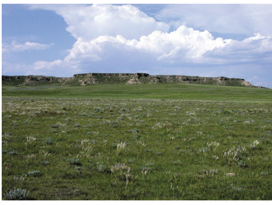
This scene is from a private holding adjacent to the U. S. Army post at Fort Carson. The Nature Conservancy, the U.S. Department of Defense, and private interests are partnering to protect shortgrass prairie bird species on and in the vicinity of Fort Carson. Pueblo County, Colorado.

Because these threats jeopardize the future of both the U. S. military and the nation's biodiversity, a new coalition has been needed to take control and secure the future. The