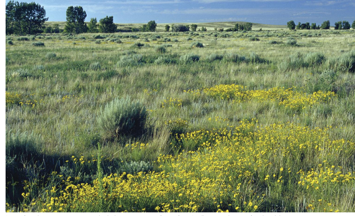
It is easy, from a distant vantage point, to imagine that the shortgrass prairie is an endless sea of grass. Actually, it is a complex mosaic of varied microhabitats, as depicted in this scene from the Bohart Ranch. El Paso County, Colorado .

the face, the post's leadership finally understood its potential impact on their mission. "Here we are with this little piece of the public trust that was becoming an island of diversity," Warren says. The diversity to which he refers includes not only flora and fauna, but also "combat systems, cultural artifacts, and habitat for thousands of men and women trying to learn how to survive on a modern battle-field."