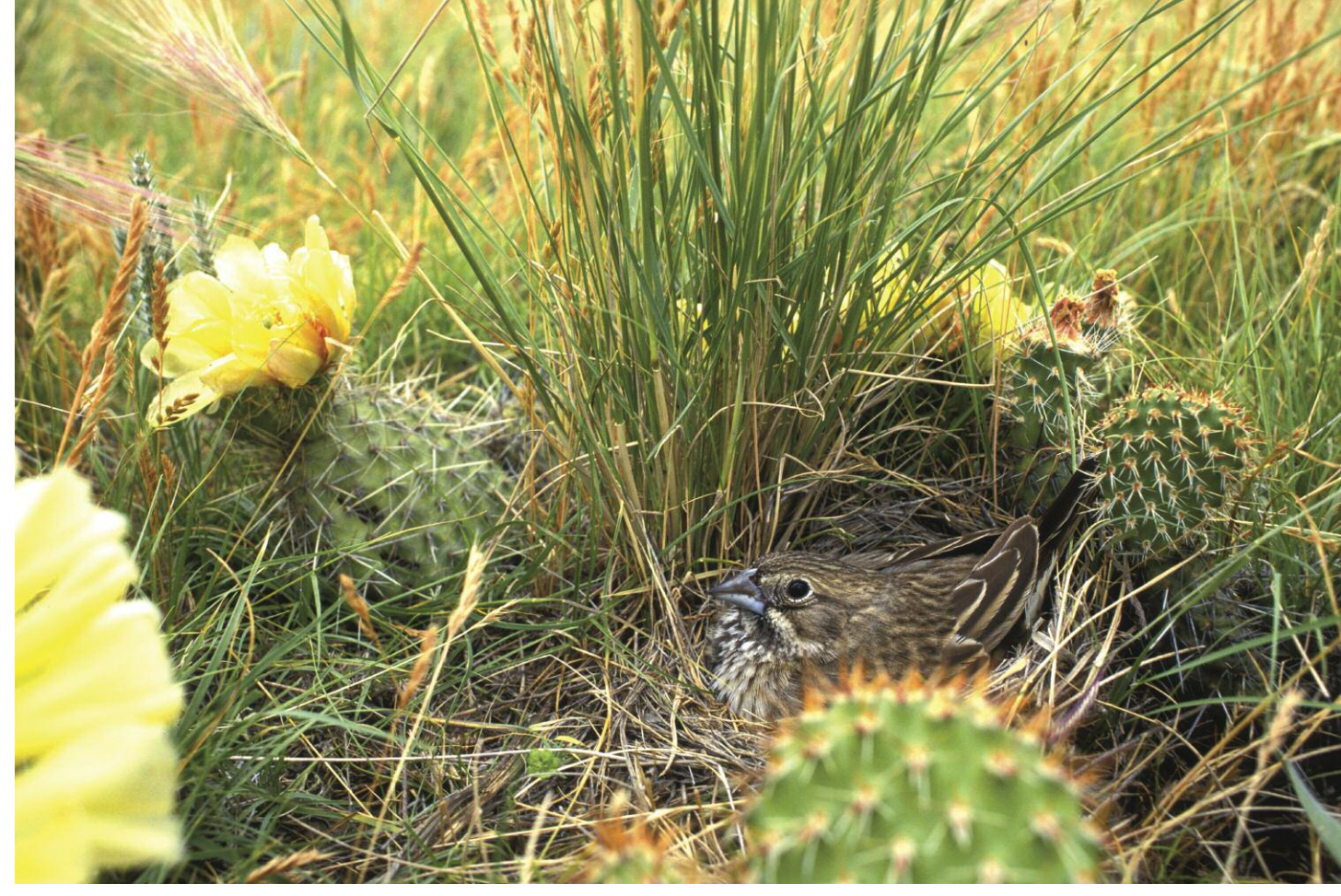
Lark Bunting. Pawnee National Grassland, Colorado; June 2002.

comes from the base of the stem rather than the tip. This new growth is more nutritious, shorter, denser, and more easily digested than older grass. For grazers that demand significant nutrition from grasses each day, prairie dog towns may be analogous to the suburbanite juice bar—a one-stop nutrition buffet. In the modern-day prairie, cattle have assumed the role of the dominant large herbivore in many areas. The evolution of the prairie seems to suggest that grazing, if not too intense, actually sustains and improves conditions for grazers and other prairie animals.