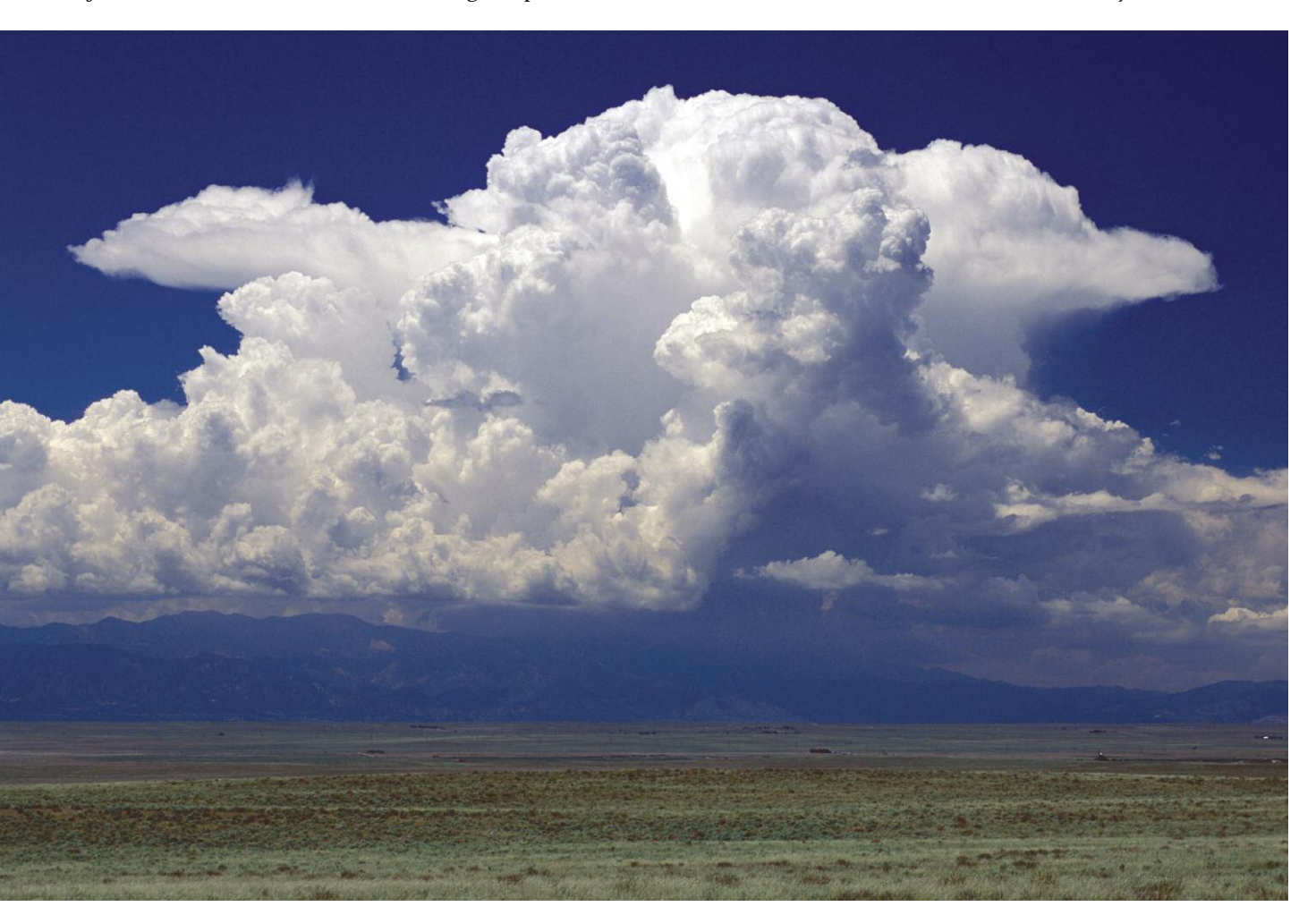
Shown here is the Bohart Ranch (Pikes Peak in background), which still supports thousands of acres of remnant sand-sage prairie—home to Cassin's and Brewer's Sparrows, Lark Buntings, and other inhabitants of the central shortgrass prairie eco-region. El Paso County, Colorado.