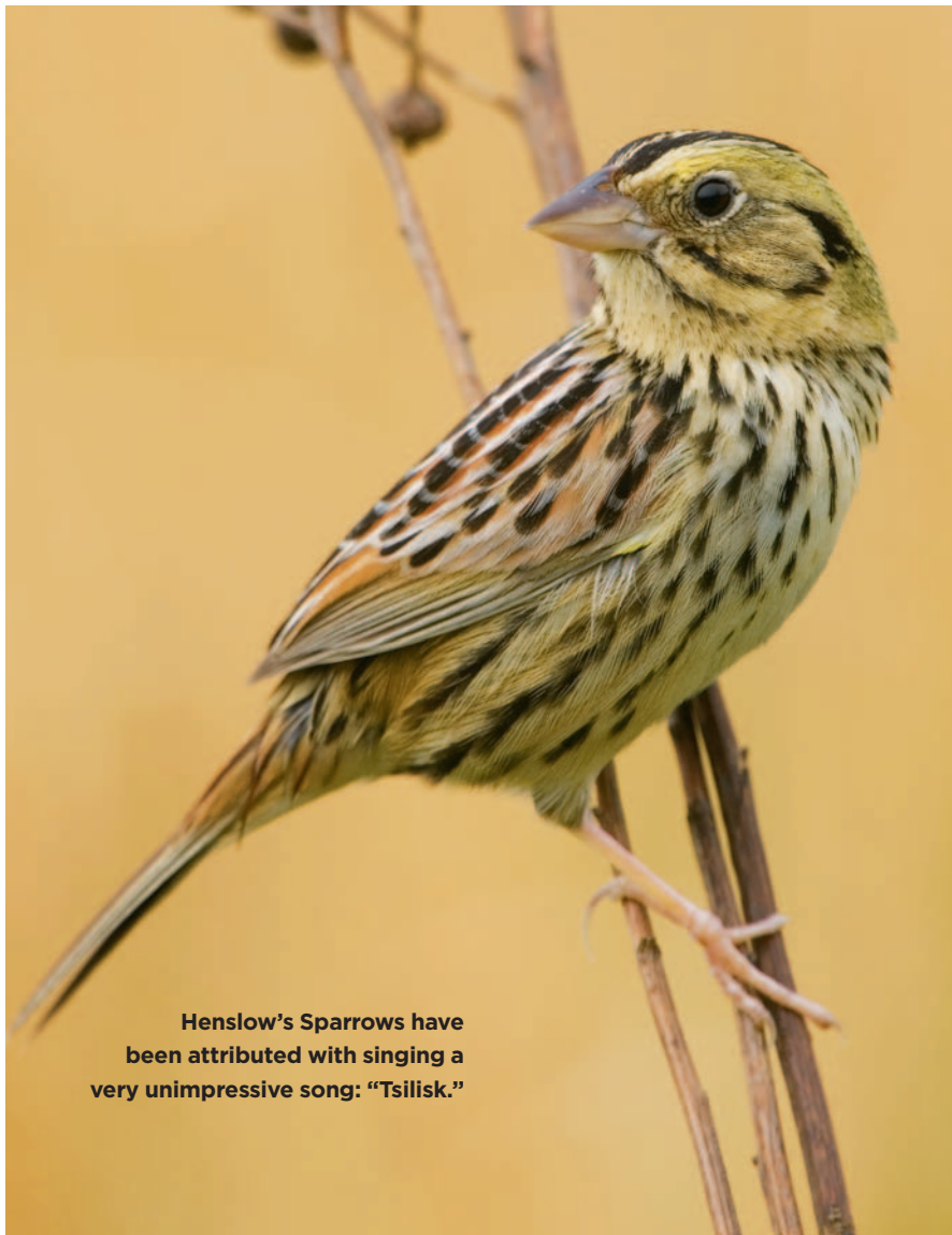
Henslow's Sparrows have been attributed with singing a very unimpressive song: "Tsilisk."

The strategic plan includes using radar to track bird movements. This technology has benefitted conservation by identifying migration routes and stop-over sites. It also