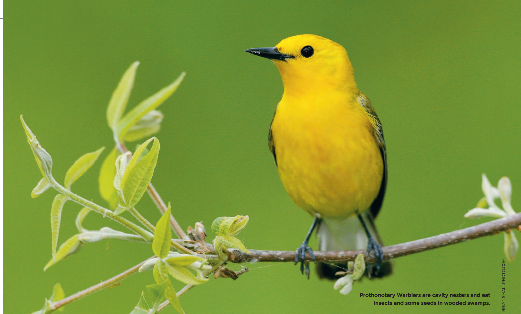
Prothonotary Warblers are cavity nesters and eat insects and some seeds in wooded swamps.

Some of the best — and last remaining — streamside vegetation in California occurs at Marine Corps Base Camp Pendleton near San Diego as well as Vandenberg Air Force Base near Santa Barbara. The forests that hug Santa Margarita River, which runs through Camp Pendleton, shelter close to 50 percent of the entire breeding population of Least Bell's Vireo, an endangered subspecies ( Vireo bellii pusillus ).