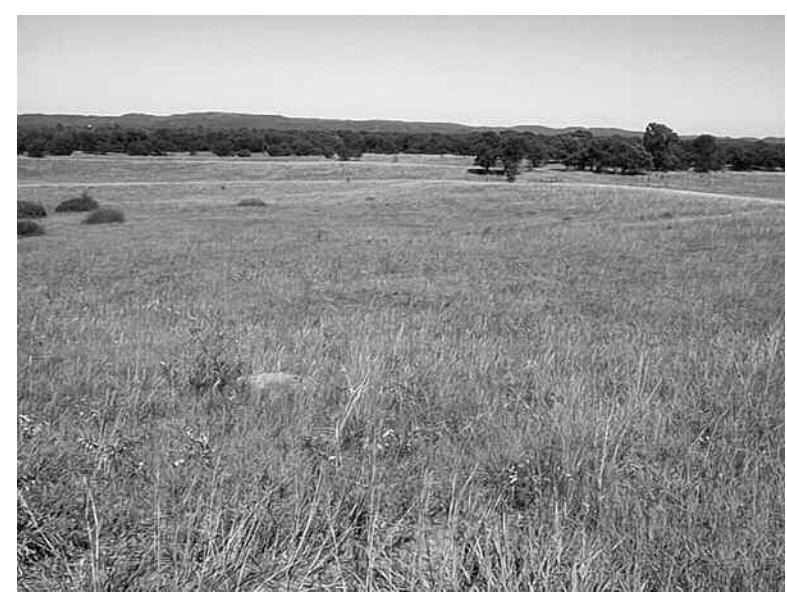
Oak Barrens Savanna Natural Area.

Controlled burns are used to manage and keep open the roughly 9,000 acres of large grasslands tracts and provide important habitat for grassland birds. Prescribed burns result in a shift in the bird community, and Lark Sparrow has been found to almost exclusively nest in savanna-grasslands that