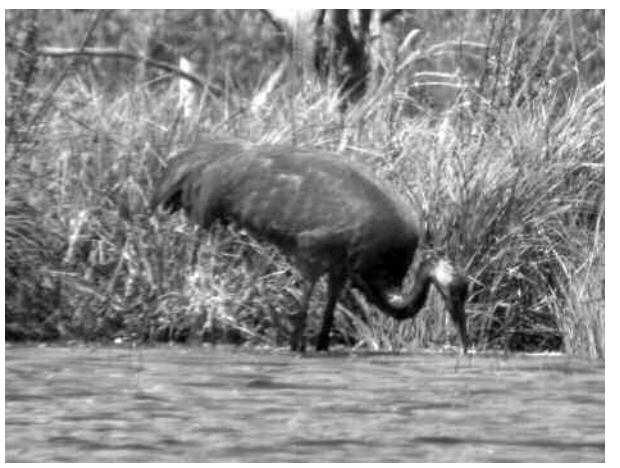
Sandhill Crane foraging at the North Flowage.

In addition, 130 bird species have been confirmed as breeders. Common forest-associated breeders include Ovenbird, Red-Eyed Vireo, Wood Thrush, Veery, Rose-breasted Grosbeak and Black-billed Cuckoo. Other good finds are Yellow-throated Vireo, Tennessee Warbler and Common Loon. However, Fort McCoy is most noted for its vast acreages of open grassland and