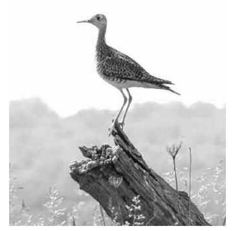
Upland Sandpiper, a common grassland species at Fort McCoy.

species checklist, and information regarding the base and the natural resources management program. There is currently no fee for visiting specific sites for birding. However, a valid driver's license is necessary to obtain a temporary pass to enter Fort McCoy. To reach the Wildlife Program office, enter at the main gate on the north side of Highway 21 and ask the guard for directions to the Wildlife Program in Building 103.