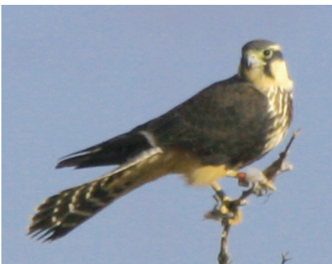
northern Aplomado falcon

The Recovery Plan recommends that an attempt should be made to establish