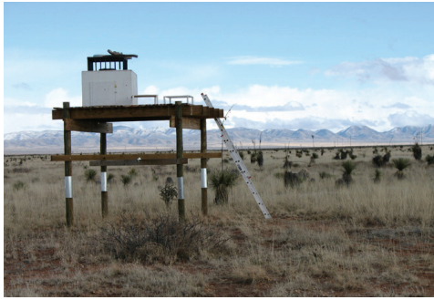
Aplomado falcon hack tower.

populations in the U.S. The intense overgrazing that resulted in shrub encroachment in Chihuahuan Desert grasslands in New Mexico and Arizona has moderated, and there has been widespread implementation of improved range management techniques. In addition, the use of DDT was banned in Mexico in 2000.