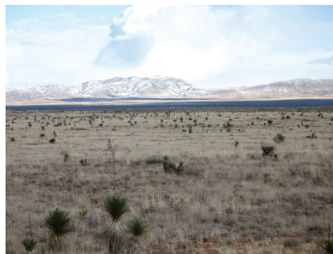
Falcon habitat, White Sands Missile Range in background.

Falcon habitat consists of open terrain with scattered trees or shrubs. In Mexico, they inhabit palm and oak savannas, open tropical deciduous woodlands, seasonally flooded coastal savannas and marshlands, desert grasslands, and upland pine parklands.