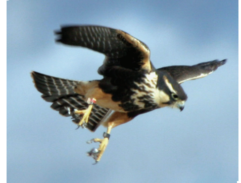
northern Aplomado falcon

Aplomado falcons are a medium-sized falcon, approximately 14 to 18 inches in length with a wingspan of 31 to 40 inches. Sexes are similar in appearance, but females tend to be larger than males.