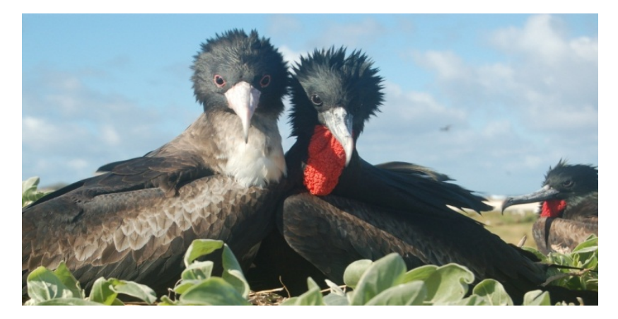
Great Frigatebirds on Tern Island in the northwestern Hawaiian Islands