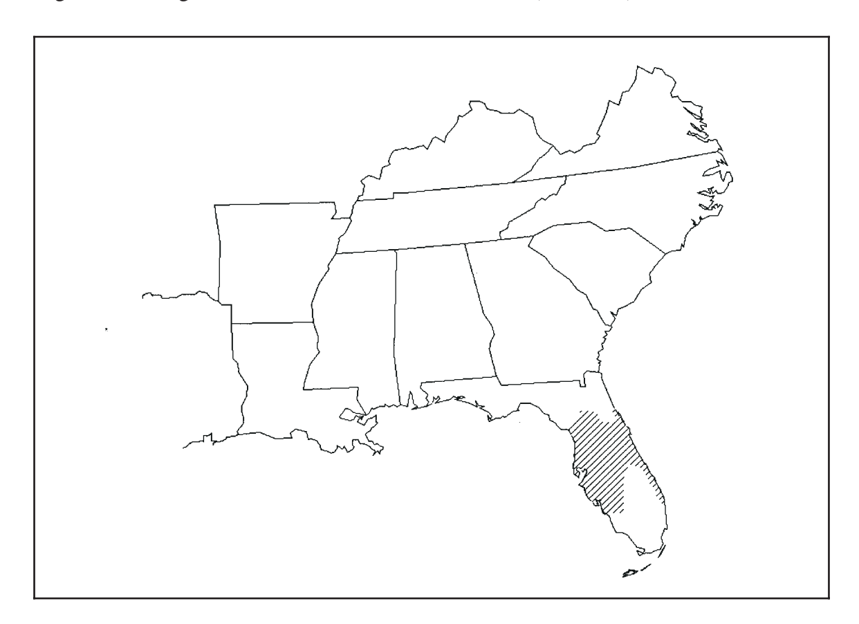
Figure 1. Current distribution of the Florida scrub jay (from U.S. Fish and Wildlife Service 1990, Woolfenden and Fitzpatrick 1996) (found in scattered populations within hatched area)

The Florida scrub jay is found almost exclusively in peninsular Florida (U.S. Fish and Wildlife Service 1990) (Figure 1). It has been reported from 39 of the 40 peninsular counties in Florida (Cox 1984) but only twice from outside this region; these alleged sightings were from Jekyll Island, Georgia (Moore 1975), and the Florida Keys. However, these sightings are thought to be either erroneous observations or escaped individuals (Stevenson and Anderson 1994). The historical range of the scrub jay extended from Taylor, Gilchrist, Alachua, and Duval counties in northern Florida to Collier, Monroe, and Dade counties at the southern tip the State (Sprunt 1954, Cox 1984). Today it is restricted to scattered and often small, isolated patches of scrub habitat (Woolfenden 1978, Woolfenden and Fitzpatrick 1996). The jay has been extirpated in Broward, Dade, Duval, Pinellas, and St. Johns counties, and populations have been greatly reduced in Brevard, Highlands, Orange, Palm Beach, and Seminole counties (Cox 1984).