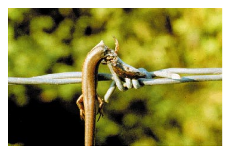
Figure 2. Loggerhead shrikes often impale prey on barbed wire or tree/shrub spines

Other than corvids (i.e., crows, jays, magpies), shrikes are the only North American songbird that regularly preys on other vertebrates and are well-known for their habit of impaling mice, shrews, small birds, lizards, and snakes on thorns or barbed wire (Figure 2). The adaptive significance of this behavior is not fully understood; but Safriel (1995)