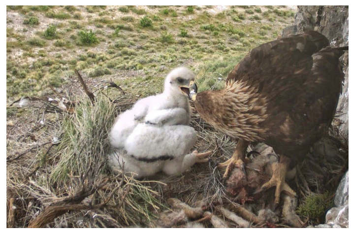
Golden eagles with one-week-old chick at Dugway Proving Ground.

Golden eagles nest on cliffs or trees in open, remote country landscapes throughout the western United States, including several DoD lands used for military training. These long-lived, but slow-reproducing, birds are protected by federal and state regulations. Recent concerns about habitat loss, declines in rabbit prey, and high levels of human-caused mortality, or "take," have resulted in a specific "no net loss" standard for the species. Accordingly, any human actions that have the potential to cause the loss of an eagle — including military training must be prevented to the highest degree possible or offset by eagles saved elsewhere. DoD installations that support nesting eagles go to great lengths to monitor eagles and prevent harm to them, including avoiding nest disturbance that is prohibited under the BGEPA.