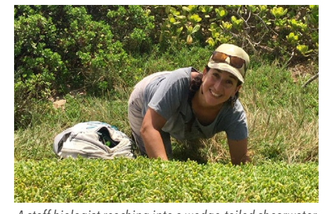
A staff biologist reaching into a wedge-tailed shearwater burrow on MCBH.

species found on their land. These efforts include studying the nesting and reproductive success of the federally endangered Ae'o (Hawaiian stilt), the federally endangered 'Alae 'ula (Hawaiian gallinule), and the federally endangered 'Alae ke'oke'o