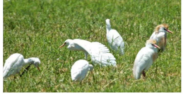
Cattle egrets in short vegetation at Diego Garcia.

long that it has seldom been tested for effectiveness. The results of the 2017 study prompted a need to field-test the hypothesis of vegetation heights above the 7-to-14-inch protocol reducing the abundance of hazardous BASH species, and thus the BASH risk. The ERDC-EL, with support from the Navy BASH program, in 2021 will kick off a project to field-test species habitat preferences under varying vegetation height regimes on different airfields. The objective of the study is to assess the abundance of medium- to larger-sized bird species on airfields having both tall and short vegetation.