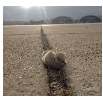
A least tern chick hiding in a crack on the airfield pavement at NASNI.

network and consulting with USFWS, the installation was able to quickly implement solutions to deter the terns from nesting in this busy area. The successful solution, which included setting out k-rails and coyote decoys on the airfield and using tern decoys and playback recordings at established colonies, ensured training operations were not