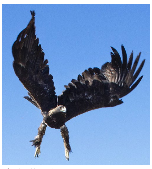
A female golden eagle at DPG.

the BGEPA. To accomplish the first objective, the team sampled nesting territories along military training routes (MTR) and non-MTR. For the second objective, the team sampled the nest presence or absence along MTR and non-MTR. Results from these two studies determined that MTRs had no detectable impact on golden