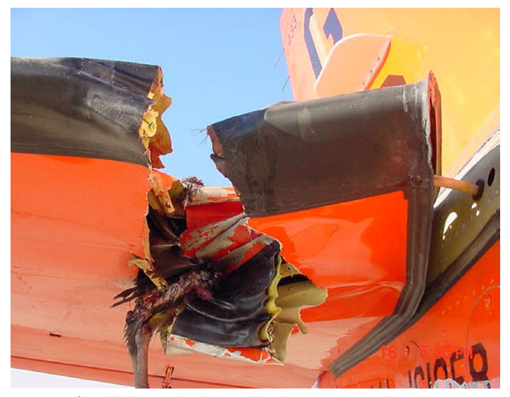
A T-45 aircraft involved in a crash with pectoral sandpipers at NAS Meridian, Mississippi.

BASH prevention on DoD airfields continues to be a major safety concern in terms of potential loss of life as well as the costs of damage to aircraft, despite an extensive array of active and passive management practices currently in use at airfields. The common presence of BASH-hazardous birds on or close to airfields results from complex interactions among their primary needs (i.e., food, cover, presence of water). Large birds that inhabit airfields typically are searching for food while smaller birds, such as grassland passerines (e.g., sparrows, larks) are attracted to food and cover. Wetlands and open water on or near airfields attract flocks of small and large waterfowl. The Air Force, Marine Corps, and Navy have comprehensive BASH programs with extensive expertise to help installations mitigate the risks from the presence of airstrike-hazardous species on airfields. For example, both the Air Force Safety Center and the Navy BASH programs develop policy and guidance and provide other types of support designed to improve flight safety and protect the mission.