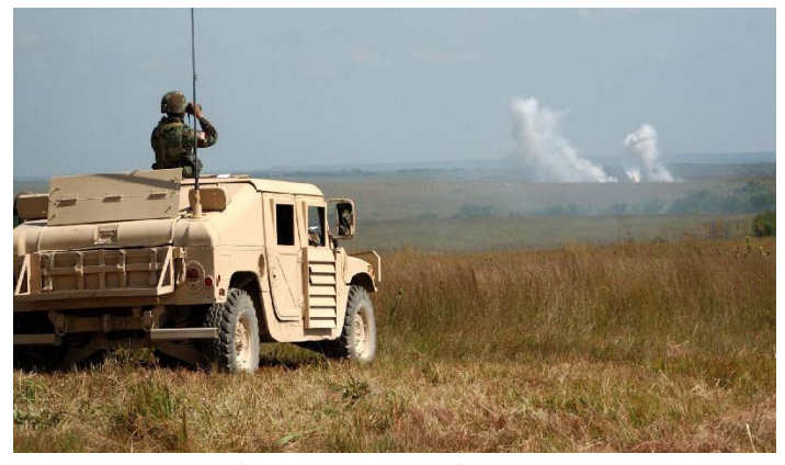
Training activities at Fort Riley, Kansas.

One example is the ongoing DoD PIF support for the INRMP at Fort Riley, a 100,656-acre Army installation located in the Flint Hills region of Kansas that includes North America's largest remaining tract of tallgrass prairie. Fort Riley's INRMP prominently mentions and addresses as a priority species the Henslow's sparrow, a bird of the tallgrass prairie and a DoD PIF MSS. A 1996 USFWS Status Review showed this species listed as endangered or threatened in 12 states and as a special concern species in another four. In that report, Fort Riley was identified as having one of the most important breeding populations of this species.