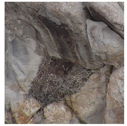
Active golden eagle nest photo from a small Unmanned Aerial System at DPG.

golden eagles. Through our research and the contributions from DoD installations, take permits are reflecting potential mitigation strategies, such as management of big game roadkill to reduce the probability of eaglevehicle collisions and eagle electrocutions near roads. Ongoing golden eagle research at DPG and UTTR using cameras in nests and collecting data on nestling health