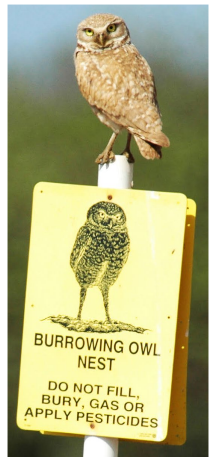
A burrowing owl at NAS North Island, California.

As the MSS list was completed in 2020, the eastern black rail, one of the 16 MSS, was listed as federally threatened. This listing confirmed the usefulness of the methods created to identify species likely to be ESA listed. Given that the intent is to raise awareness of species that may become ESA listed, the WG removes a species from the MSS list once it becomes federally threatened or endangered. Removing the eastern black rail brings the current MSS list to 15 species. In addition to these 15 MSS, DoD PIF categorized an additional 37 declining species as "Tier 2." Most of these species are in long-term decline and have potential for future mission impacts if federally listed; however, DoD PIF does not consider them to be