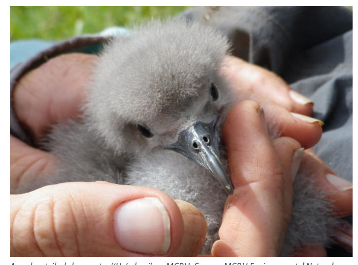
A wedge-tailed shearwater ('Ua'u kani) on MCBH.

kani, or wedge-tailed shearwaters, monitoring of the facility's MBTA-protected red-footed booby colony, and annual Audubon Christmas Bird Counts. These efforts help MCBH natural resources managers better understand the birds' biology and ecology, which in turn promotes more informed management decisions that increase MCBH's ability to protect these species while allowing the base to carry out its primary training missions.