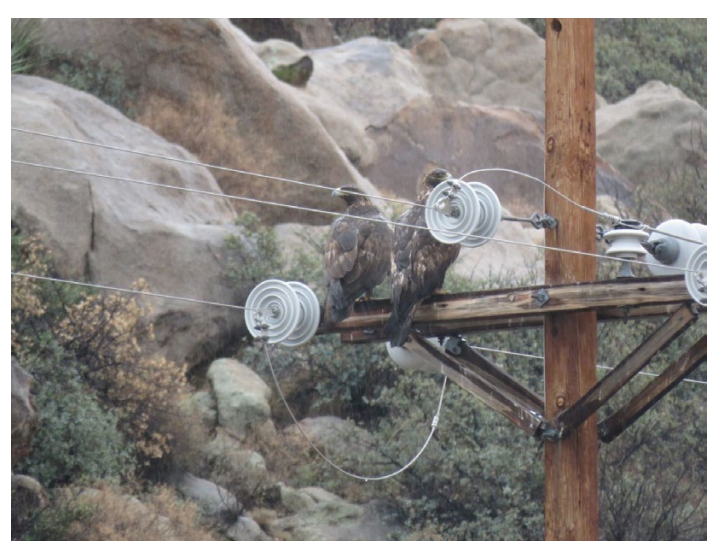
A pair of golden eagles perch on a power pole at WSMR, New Mexico. The two phases closest to the eagles are de-energized.

Outages disrupt a variety of important activities, and are costly to repair. Additionally, the electrocution of protected species can lead to regulatory restrictions that interfere with the military mission. The recognition that the raptor population and the existing electrical infrastructure were a threat to each other and to the mission helped galvanize WSMR to actively mitigate the problem. In 2014, WSMR worked with EDM International, Inc. (EDM) to complete an Avian Protection Plan (APP), which detailed materials and strategies for remediating hazardous power poles and protecting birds and WSMR's mission.