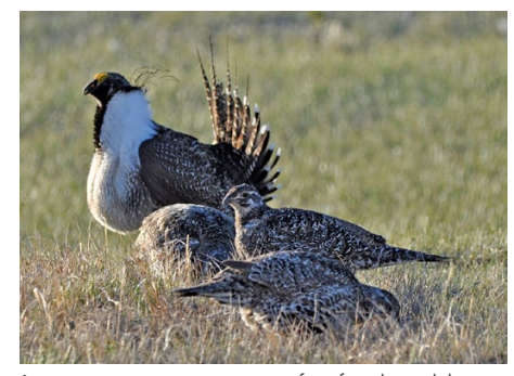
A greater sage-grouse, rear, struts for a female at a lek, near Bridgeport, California.

"leks." Visibility is typically determined using a bare-earth digital elevation model (DEM). The limited accuracy of these models would over-estimate the size of leks and therefore limit the military's ability to operate in these areas. This project incorporated a laser scanning