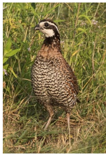
NOBO photographed in a Fort Hood, Texas training area.

become the well-studied subject of many different management programs. Due to the frequency of NOBO occurrences on military installations, potential to impact testing and training missions if federally listed, and conservation concerns, it is currently a DoD PIF MSS. If a MSS is listed under the ESA, proactive DoD installation MSS monitoring and management can provide a sound foundation for ESA Section 7 consultations and potentially avoid impacts to essential installation and mission activities, such as construction and training.