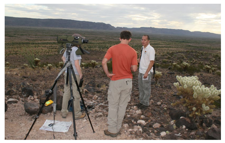
DoD biologists collect data on bird distribution, abundance, and species habitat relationships on most DoD installations with INRMPs.

Data management and retrieval is a key component of any natural resources management activity. DoD has a large collection of bird field data as a result of its INRMPs, surveys, and diverse installations. DoD PIF is collaborating with Point Blue Conservation Science and Klamath Bird Observatory to permanently archive DoD bird data in the Avian Knowledge Network (AKN). This database benefits INRMP implementation and helps installations comply with the Migratory Bird Treaty Act (MBTA), ESA, and NEPA.