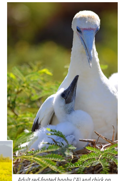
Adult red-footed booby ('A) and chick on MCBH.

Natural resources staff at MCBH also conduct longterm monitoring, which includes biannual waterbird surveys, annual breeding surveys of burrowing seabirds including the 'Ua'u