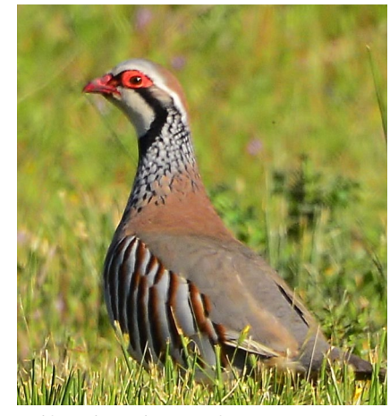
Red-legged partridge at Naval Station Rota, Spain.

Military airfields have traditionally followed the 7-to-14inch (or often even shorter) vegetation maintenance protocol, which has been a standard practice for so