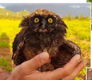
A juvenile pueo at Nuupia Pond Wildlife Management Area.

(Hawaiian coot); tracking movement patterns to better understand habitat use and home range sizes of the Ae'o and the 'A (red-footed booby); and conducting baseline studies on presence, habitat use, and basic biology of the elusive, endemic pueo (Hawaiian short-eared owl), which is MBTA-protected and stateendangered.