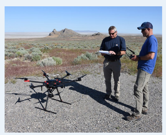
A sUAS used for monitoring efforts at DPG.

To generate that information, DPG was the host installation for a two-year DoD ESTCP project (RC18-5046) that monitored eagle nests on the installation. The project compared three different methods: an on-the-ground human observer, a military Unmanned Aerial System (UAS), and a small UAS (sUAS) platform. Researchers found the sUAS to be an extremely useful tool, able to quickly identify nests and take photographs to help accurately determine the age of the golden eagles. The data collected directly contributes to ensuring continued mission operations at DPG. The project results will be made available through a final technical report and a guidebook for range managers that focuses on using the sUAS platform for avian monitoring and data collection.