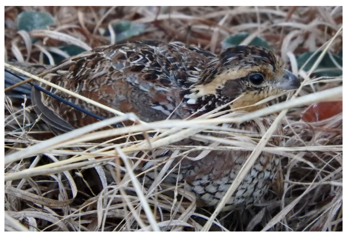
NOBO at Fort Bragg, North Carolina.

NOBO have historically been documented on Fort Hood, but little information is known about the population size, distribution, or status. Existing vegetation data from Fort Hood confirmed that some of the most suitable habitat for the NOBO in central Texas occurs within the boundaries of the installation, primarily in training areas containing both grasslands and shrub cover. So, to gain knowledge about the potential impacts of this MSS on DoD training, the Fort Hood Natural Resources Management Branch Adaptive and Integrative Management (AIM) team, in 2019, initiated focal species research for NOBO populations.