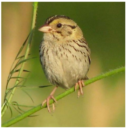
A Henslow's sparrow, one of the current MSS. If the Henslow's sparrow becomes federally listed, training impacts could occur on midwestern and eastern installations with grasslands.

other migratory birds are declining, DoD PIF focuses on MSS because these species have high potential to impact military testing, training, and safety missions should they become ESA listed. This list consists of 15 bird species that are present on multiple DoD installations and are at risk of becoming federally protected under the ESA if current population declines continue.