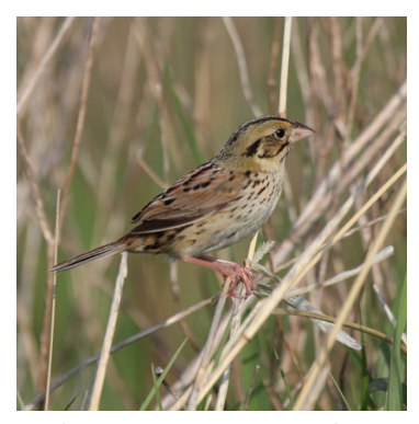
Henslow's sparrow.

The Henslow's sparrow also benefits from these actions to reduce wildfires. To accommodate the sparrows' nesting, resource managers designated "noburn" areas in the annual burn plan. These areas should not be intentionally burned, and any wildfires starting there should be aggressively extinguished. Due to the high likelihood that maneuver and gunnery