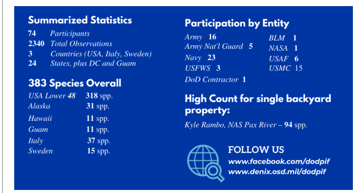
DoD PIF Backyard Bird Blitz results graphic.

In addition, groups of biologists and skilled avocational birders often collaborate to conduct Bird Blitz or Bio Blitz events, taking advantage of strength in numbers. This past year, due to COVID-19, DoD PIF led a virtual Backyard Bird Blitz through Facebook. This event called on DoD members to track the number of bird species spotted in their own backyards. Outreach events also occur during the DoD PIF Steering Committee's Annual Meeting, with participants conducting surveys at that year's host installation. All data reported during these events is then shared with staff biologists.