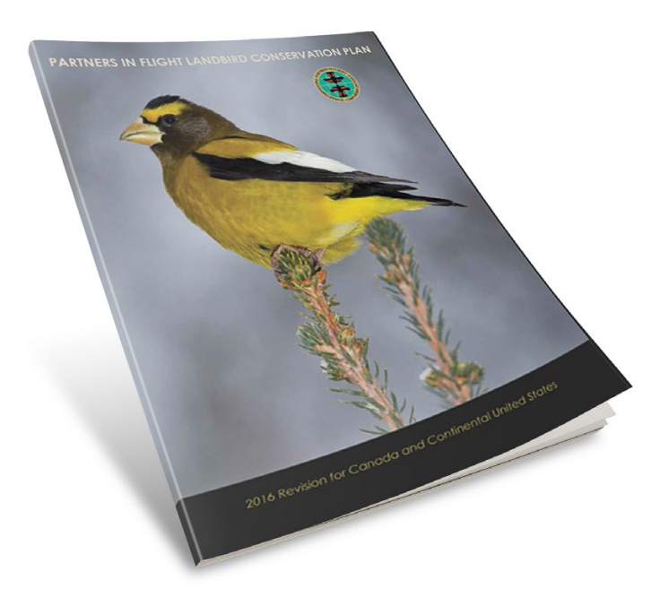
The 2016 Partners in Flight Landbird Conservation Plan lays the groundwork for Watch List species and for conservation action in large landscapes with Migratory Bird Joint Ventures coordination. Source: PIF