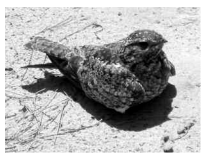
Common Nighthawks breed on sandy soil.

Most of the ponds on Fort Drum are isolated and difficult to view, but they shelter nesting Pied-billed Grebe and the occasional Great Blue Heron rookery. Perhaps the best place to observe wetland birds is Matoon Creek Marsh west of Carr