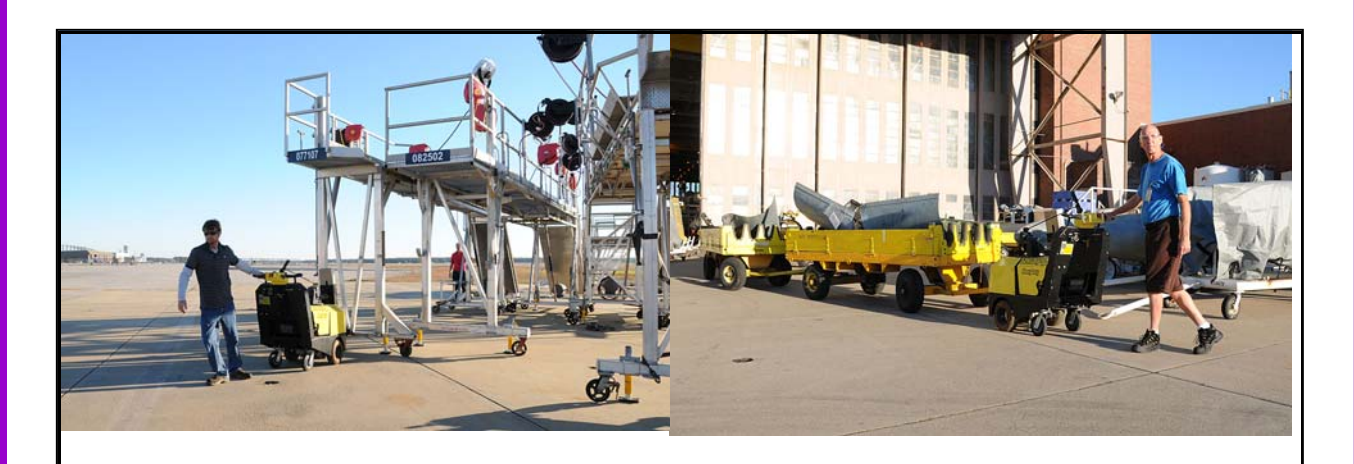
Not only can you use the Cart Caddy for moving an AV8 wing, but many other items as well!