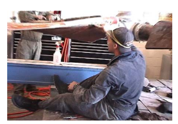
Employee working overhead in unsupported static posture.

The NAVFAC Ergonomics Team worked with ACU-4 and Anteon Corporation to design and build a propeller fixture for the shop. The fixture is designed to maneuver the propellers from a horizontal position to a vertical position with stops in between to encourage employees to work in neutral postures. If you can bring the work to the worker you can reduce discomfort, fatigue, and risk of injury.