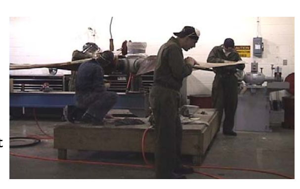
Employees bending over propeller and kneeling.

During site visits to Assault Craft Unit (ACU)-4 in Little Creek, Virginia, and ACU-5 in San Diego, California, ergonomists with the NAVFAC Ergonomics Team found workers in the hovercraft propeller repair shop working in awkward postures. Employees were working bent over the propellers, kneeling or reaching up with their hands above shoulder height with neck extended.