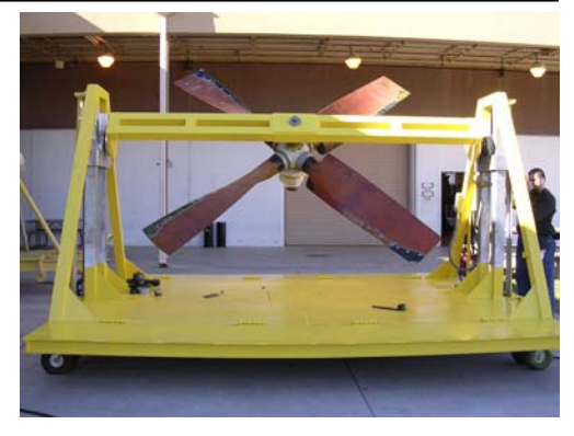
New adjustable prop fixture.