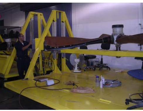
Raising the height of the propeller.

The fixtures implemented at ACU-4 in Little Creek, Virginia have also been constructed and delivered to ACU-5 in San Diego, California. The site visits, design, and prototype were paid for with funds from the Hazard Abatement and Mishap Prevention Program.