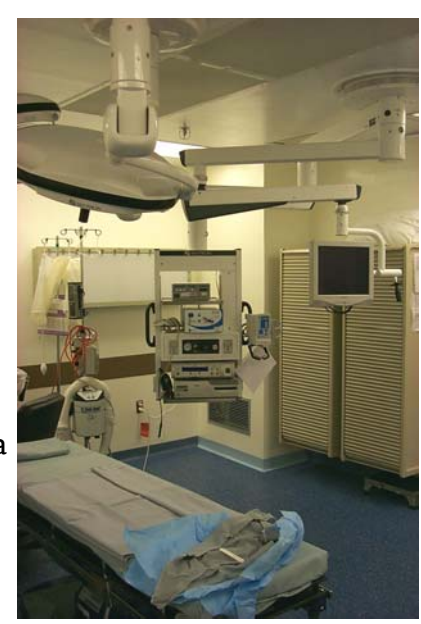
Swiveling racks and height adjustable system eliminate working in non-neutral postures.

The swiveling racks allow lighting and instruments to be moved into positions with a reach of 90 degrees to key target areas via a height adjustable system featuring tethered remote hand controls for convenient up/down placement and operation of equipment per each surgeon's individual preferences. Thanks to the adjustable equipment shelves allowing 360-degree positioning around the entire periphery of the patient, these features eliminate the need for surgeons and staff to force and contort their bodies around OR gear. Most importantly, working in non-neutral postures reduces the risk of WMSDs.