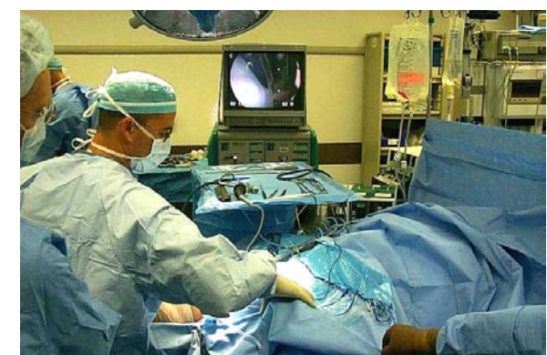
Surgeons and OR staff stand for long hours and adopt non-neutral postures during VES procedures.