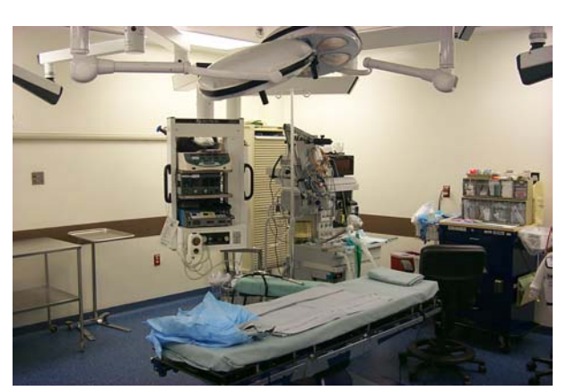
System of ceiling-mounted boom racks and flat-panel video displays located on suspended, swiveling racks reduces clutter in OR and allows surgical team to work in neutral postures.

Based on observations and results of the JR/PD, NAVHOSP Rota's recommendations for new ergonomically designed OR equipment was validated. This included seating for surgical staff and Skytron equipment carrier racks that would eliminate non-neutral work postures and mitigate the effects of standing for long periods. In the process, potential safety hazards created by cable and gas line clutter and electro-surgical smoke would also be eliminated as these utilities would now be re-routed through ceiling outlets passing through the Skytron system.