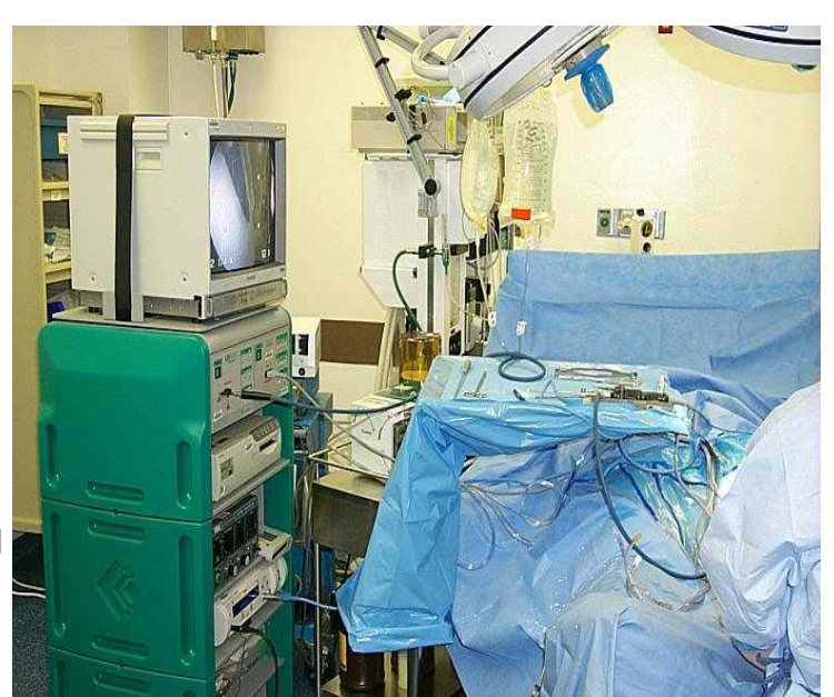
The OR was congested with equipment.

NAVHOSP Rota recommended several upgrades to the OR configuration, including installation of