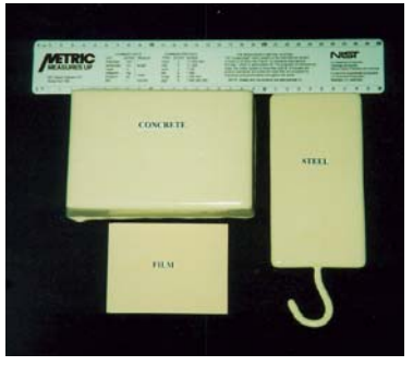
Fig.2. Samples of the Coating