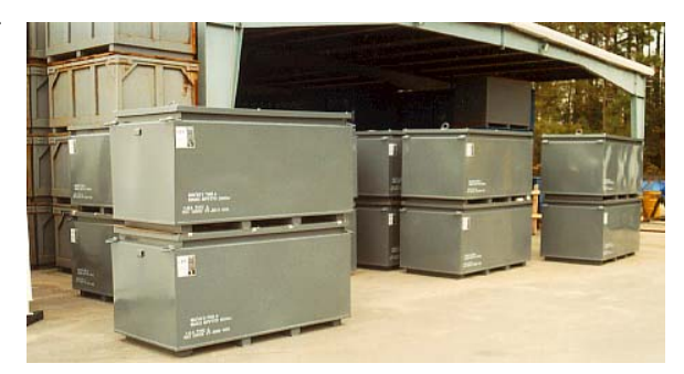
Fig. 4. Waste Containers

containers fit inside each large container for shipping