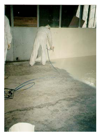
Fig.1. Coating Application

<u>Low-Temperature Tests of Coating</u>: A test program for the coating (Polibrid 705) based on ASTM standard test D1211 was completed in September 1998 (7,8). The test was performed at the National Institute of Standards and Technology (NIST). The objective of the test was to determine the temperature cycling effects on this coating in order to assure its long-term performance in the Arctic environment. Samples of the coating were prepared on concrete and metal substrates as well as free film by Carboline (Fig. 2), the manufacturer of the coating material. There are a number factors influencing the aging of a coating material such as heat, ultraviolet radiation, rain, temperature cycling, etc. A modified