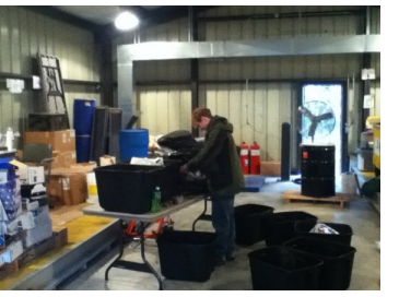
Sorting solid waste is part of a comprehensive solid waste stream analysis.

The Minnesota Army National Guard Sustainability Team is pursuing several initiatives to maintain and enhance the installation to the highest possible environmental standard. They conducted a pilot project at Camp Ripley using a "liquid food digester" for organic waste in a dining facility and installing water bottle fill stations throughout the