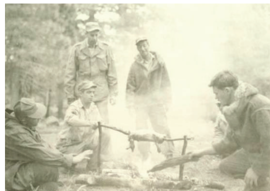
Survival Training, Stead AFB

The report can be used to develop installation-specific contexts to support the identification and evaluation of Vietnam-era special schools on those installations.