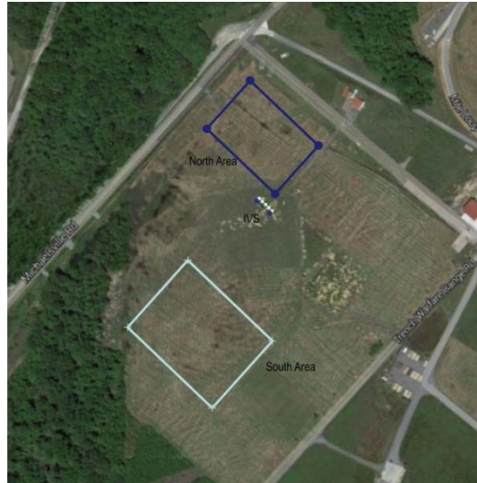
Figure B-1 - Aerial photo of the demonstration of capabilities site showing the two subareas and the location of the IVS

The demonstration of capability (DOC) site at Aberdeen Proving Ground is comprised of two subareas as shown in the image below.