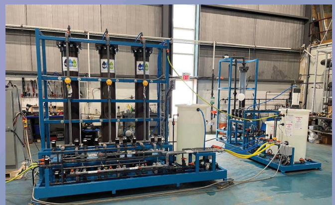
Ion Exchange/AmmEL-H 2 Sub-system

The project will design and demonstrate the D-LEWT 2.0 system and analyze performance including fuel production and water reuse. The demonstration will springboard this technology for wide-spread DoD use.