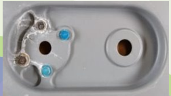
Floorboard Corrosion Testing