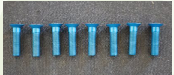
Blockade Coated Fasteners