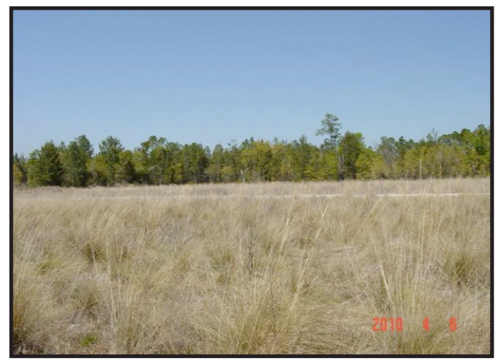
AFP 2 in 2010, looking north from permanent photo point.