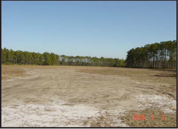
LZ 102 in February 2010, looking east from permanent photo point. Topsoil was spread in rotor-wash areas, and native seed was planted in the winter of 2010.

The ITAM staff has ongoing plans to increase the capacity of the nursery and expand the species of seed collected. By collecting local varieties of seed, we improve our potential for a successful planting, because local ecotypes are adapted to the environmental conditions of Camp Blanding and therefore have an increased chance of survival over seed purchased from further distances. By using native plants in our rehabilitation of training areas, we provide a safe, sustainable, and maneuverable area for troops as well as sustainment of and improvement to ecosystem structure and function.