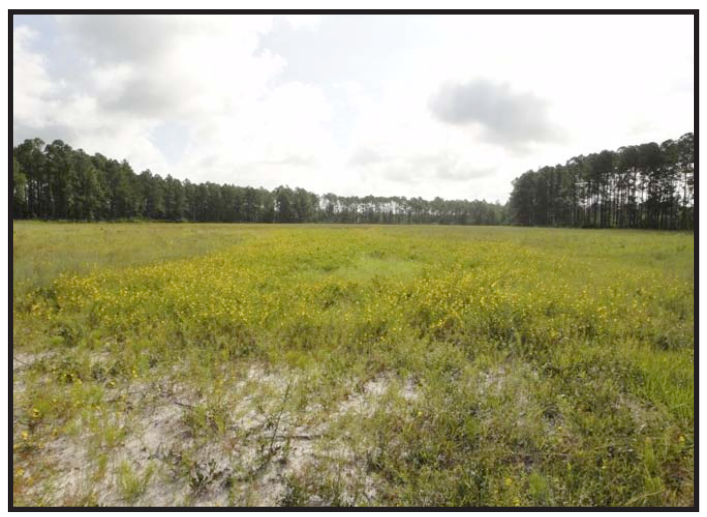
LZ 102 in August 2010, looking east from permanent photo point. Yellow flowers in picture are from Partridge pea.