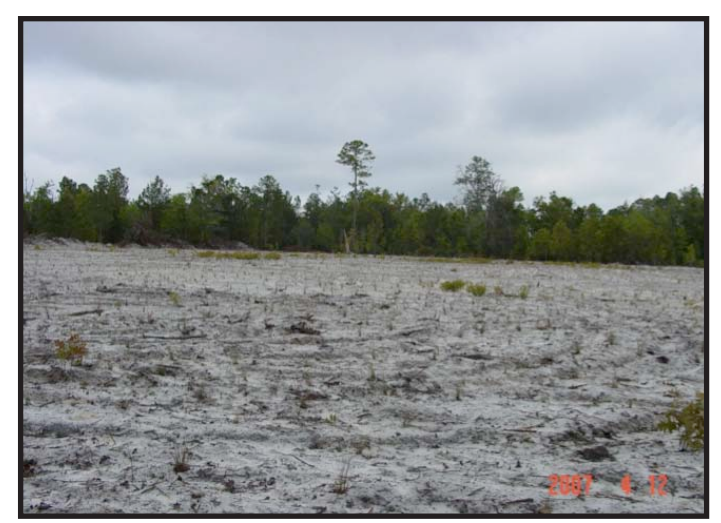
AFP 2 in 2007, looking north from permanent photo point. Site was cleared in 2006 and planted with wiregrass plugs in February 2007.