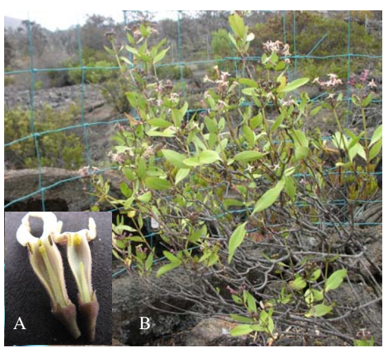
A) Kadua coriacea flowers showing heterostyly. B) Adult plant of Kadua coriacea .

A summary on the findings of the study suggests that in 2009, K. coriacea's flowering peak in PTA occurred from April to July, following the rainy season. However, some plants were found to be flowering earlier and/or later than the peak dates. The majority of the plants in the population are adult, indicating that most plants are capable of reproducing. The flowers of K. coriacea are heterostyly (having different flower morphologies, usually to promote cross pollination) and occasionally varying in flower size and color. All of the five manipulated pollination experiments resulted in a fruit set at different proportions. Therefore, the preliminary results suggest that plants may self-pollinate. Self-pollination may lead to inbreeding and possibly inbreeding depression, although the genetic fitness of the seeds and seedlings are yet to be investigated.