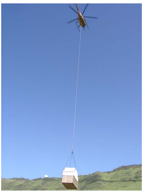
Helicopter delivers a plant box filled with endangered plants to a remote native forest where NRP staff re-introduce them to the wild.

The precious seeds were placed in petri dishes and grown in incubators. Form there, seedlings were moved into the nurseries where they were nurtured and monitored until they reached a full meter in height, a process that normally takes up to three years. Unfortunately, during these ten years of intensive management, the last remaining Cyanea superba went extinct in the wild. But NRP anticipated this sad day and the Cyanea seedlings that were growing in NRP nurseries would soon fill the void in the native forest of Makua. To date, over 250 Cyanea superba plants have been grown and returned to Makua by NRP staff and this week's delivery would raise the number by an additional 29 plants.