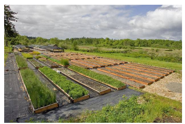
TNC's Shotwell's Landing Nursery.

The infrastructure goal for plug production was to build a plug propagation area that is easily serviceable and that provides all the components necessary for the production of high quality plugs deliverable on a precise schedule. The plugs grown for this project are to be transplanted into seed production areas outside of the nursery. Plugs produced for this project need to be grown in an ambient temperature nursery, also known as an "outdoor" nursery. The existing plug production area at the nursery was improved and expanded to provide the growing capacity necessary for the production demand under this project. Engineered non-code metal cold frame buildings were purchased and transported. Three 96' x 20' buildings