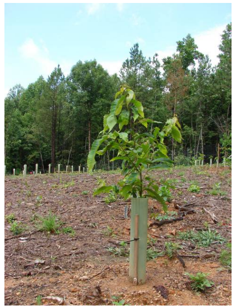
A two-year old hybrid chestnut seedling planted in April 2009 at the American chestnut backcross orchard at VTS-Catoosa.

100% American chestnut trees. Within each generation, only trees exhibiting both blight resistance and traits that are more outwardly American chestnut are used to produce seed for the following generation. The term "backcross" is used to indicate that a 50/50 hybrid (an offspring with parents of two different species, in this case, American chestnut and Chinese chestnut) is crossed back to a plant of the same pedigree as one of its parents. Backcrossing is used with American chestnuts to get trees that hold onto only one small portion of the genetic code from their Chinese ancestors — blight resistance, but that still look like American chestnut trees.