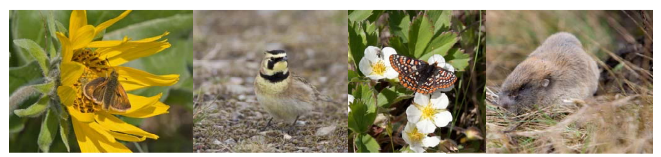
The federal candidate species that will benefit from the prairie restoration: (Left to Right: Mardon Skipper, Streaked Horned Lark, Taylor's Checkerspot, and Mazama Pocket Gopher).

The open prairie landscape on Fort Lewis is used extensively for most military training, including artillery practice, large arms fire, Stryker vehicle training, firebase construction, parachute drop zones and foot training. Habitat restoration and enhancement efforts allow military trainers greater flexibility to use existing DoD lands and support Fort Lewis' commitment to recover federal candidate species.