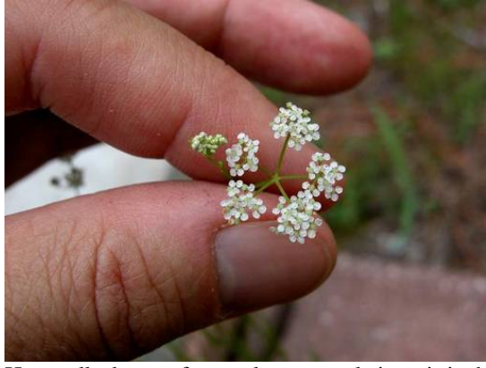
Harperella, known from only ten populations, is in the same plant family as carrots and dill, as well as several other plants that have medicinal value.

Some of the imperiled plants DoD is concerned about, such as Harperella ( Ptilimnium nodosum ), are already part of CPC's National Collection of Endangered Plants, wherein CPC institutions are assigned to secure genetic samples ex-situ in case a species becomes extinct or no longer reproduces in the wild.