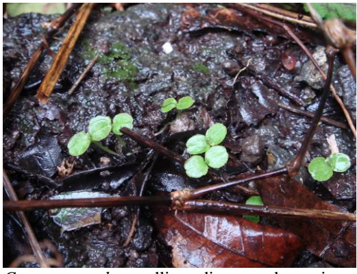
Cyanea superba seedlings discovered growing in the wild beneath plants that had been reintroduced into Kahanahaiki by NRP staff.

Fences were built to keep pigs and goats from damaging the Cyanea's fragile roots and seedlings. Invasive weeds were kept in check. Slug deterrents were put in place to keep these non-native plant predators from nibbling up precious Cyanea seedlings. Rattraps and rat bait stations were put in place to keep rodents from decimating the Cyanea fruit. And if the NRP staff could get to the plants before the rats, they would collect fruit and bring the seeds back to the seed lab.