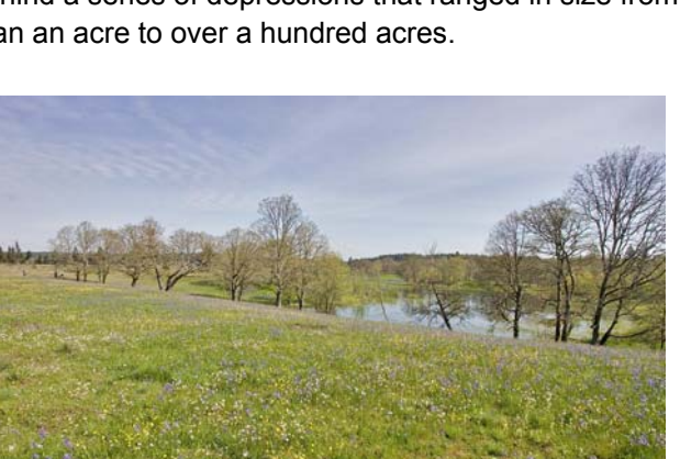
A kettle wetland surrounded by Garry oak in high quality prairie in the artillery impact area on Fort Lewis. This is one of only a few wetlands that still resemble what they historically looked like and all are located in the Artillery Impact Area (AIA). The AIA prairie is maintained by artillery-initiated fires since the Fort was established in 1917. All other prairie wetlands have now been encroached by conifers around their margins.

Interspersed in these prairies were numerous kettle wetlands. These were formed when large chunks of ice that were carried in the glacial floods and became buried by subsequent debris flows. As the ice slowly melted, they left behind a series of depressions that ranged in size from less than an acre to over a hundred acres.