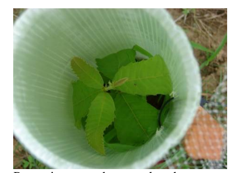
Protective tree tubes are placed on top of seeds and seedlings as they are planted to protect the trees from small mammal herbivores.

All of this changed after the arrival of the Asian chestnut blight ( Cryphonectria parasitica ) in the United States in the late 1890s. The first documented occurrence of the blight in the United States was in 1904 at the New York Zoological Garden. Its microscopic spores are released into the air and infect chestnut tissue when they land on wounds or trunk fissures, which are created when a tree matures. This fungus decimated American chestnut stands and, by 1950, most of the chestnut trees throughout its native range, east of the Mississippi, were dead or dying. In just a few decades, the American chestnut went from being the keystone species on an estimated 9 million acres to a relic, hanging on in the sprouts arising from the root stock of the fallen trees and a few surviving mature trees scattered across the species' range. The sprouts, too, are almost always killed by the blight before they reach reproductive age, so natural reproduction is almost unknown.