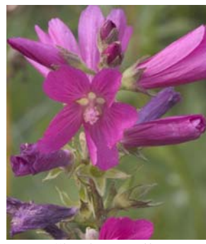
Rose Checker Mallow