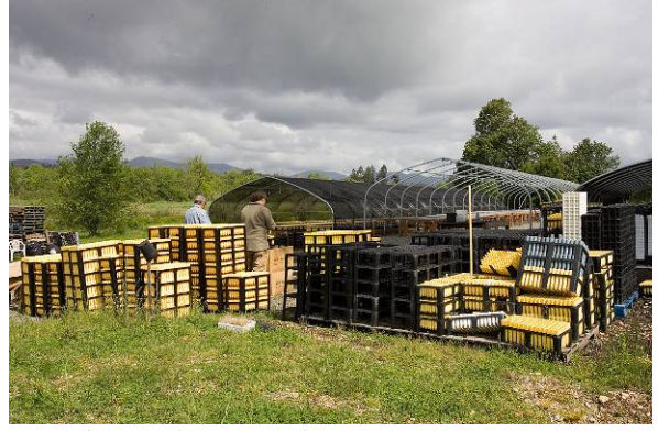
Preparing seed trays at The Nature Conservancy's Shotwell's Landing Nursery.

Forty large seed production boxes (32'x 4') were installed, filled with growing medium, and sown with seeds collected during the 2005 and 2006 collection seasons. An additional 12 smaller boxes were built or retrofitted, filled, and sown with target species. Three different types of irrigation systems were installed in the boxes. The entire system is controlled automatically on five different zones that can be programmed according to changing irrigation needs throughout the year. The system of mainlines and lateral lines was designed for flexibility over the course of the project: as seed crops germinate, grow, mature, and produce seed, their irrigation requirements will change.