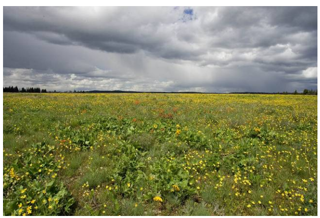
Puget balsamroot, Indian paintbrush and western buttercup bloom in high quality prairie in the artillery impact area. This prairie is home to all four federal candidates that occur on Fort Lewis and contains the highest quality prairie remaining because of the annual artillery-initiated fires.

There are only four known occurrences of Hall's aster, two of which occur on the Fort in patches less than two square meters; the Washington Natural Heritage Program lists it as State Threatened. Another rare species found in this habitat is Texas toadflax ( Nuttalanthus texanus ). This species is known only from three locations in Washington, one of which is on the Fort. Several other rare prairie species also occur in this habitat type. There is only one known population of rose checker mallow ( Sidalcea malviflora ssp.virgata ) in Washington, which is listed as State Endangered.