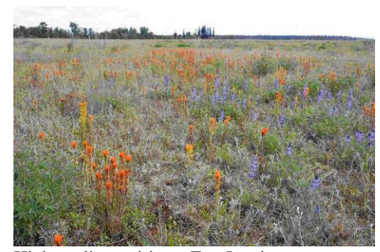
High quality prairie on Fort Lewis.

Approximately two-thirds of the remaining prairie habitat now occurs on Fort Lewis, while a handful of smaller parcels are located on state and county property. Many prairie species are now very rare: two are federally-listed as threatened, four are federal candidate species, and there are five federal species of concern. In addition, several more species are listed as endangered, threatened or sensitive by the State of Washington. Many more that have no ranking because they occur elsewhere in their range are so rare locally, that they are only known from just a handful of plants. Over three dozen species are known to already be extirpated from the prairies and many more are on the verge of being extirpated.