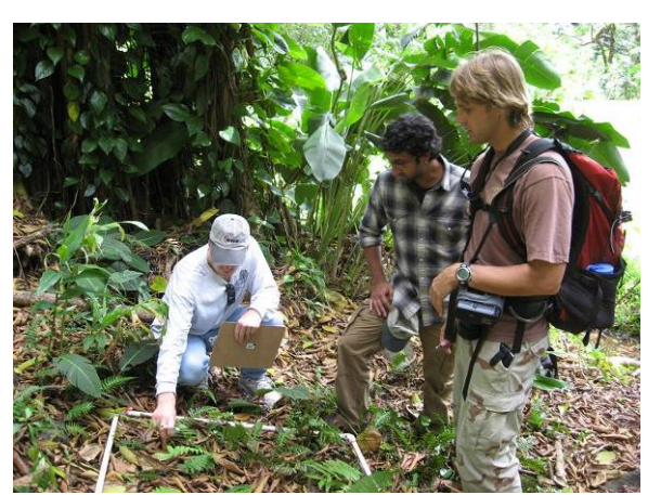
Workshop participants complete an exercise in monitoring.

The six-day workshops focused on 17 different topics, including rare and imperiled plants, plant protection and legislation, how to measure success, and how to inventory and monitor imperiled plants. Nearly 40 experienced botanists from academia, agencies and non-governmental organizations helped to develop the workshop. These botanists also worked collaboratively to put together take-home resource materials for attendees.