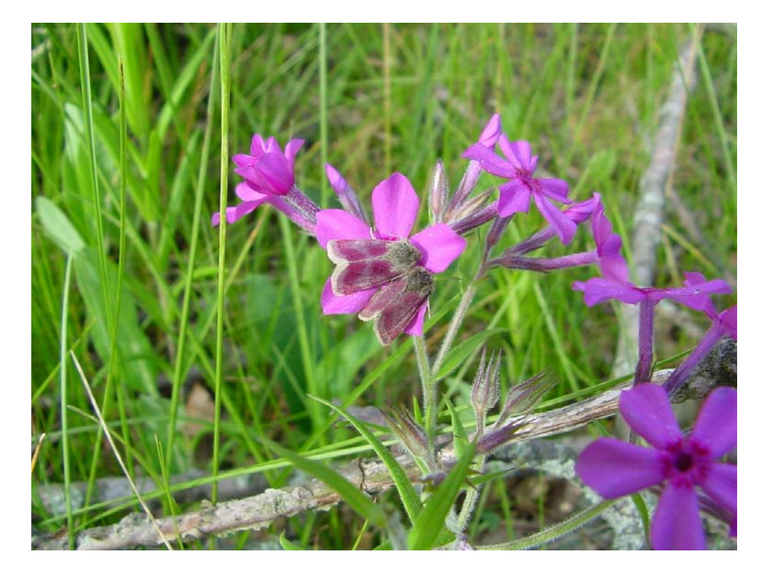
November 2009 Photo of the Month Winner!