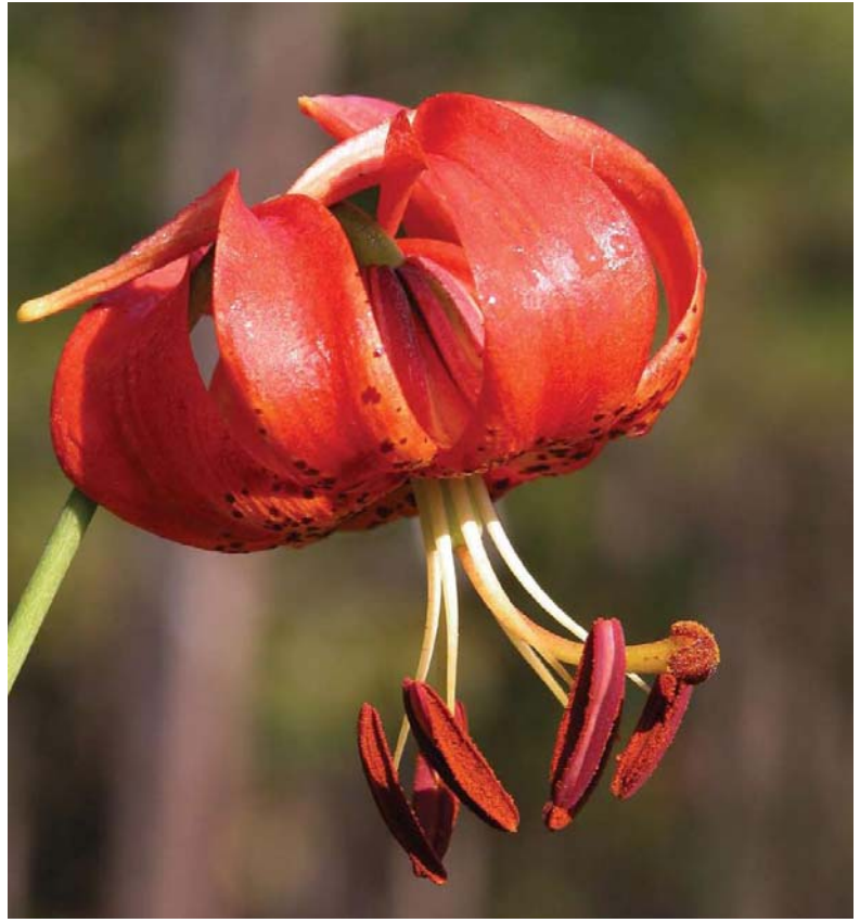
Did You know? The rare Sandhills lily ( Lilium pyrophilum ) grows in fire-maintained habitats on Fort Bragg, North Carolina.