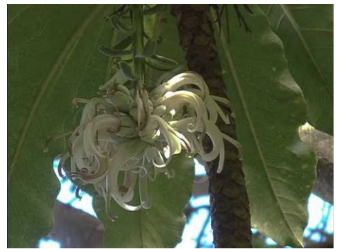
Cyanea flower. The Cyanea superba is one of 73 federally-listed endangered species that the Army manages on Oahu.

NRP staff is hopeful that this week's re-introduction of Cyanea superba will be a significant boost to the seed making potential. "And if we can protect the forest around them," says Keir, "then hopefully we can just step back and let it happen."