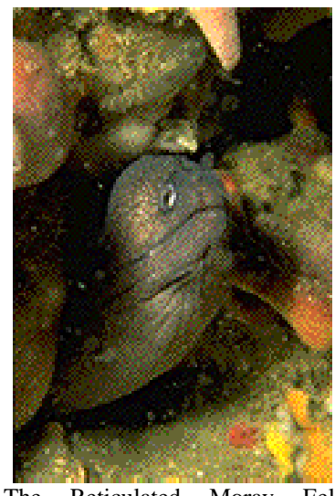
The Reticulated Moray Eel, Muraena retifera.

The body of the moray is patterned, with camouflage also being present inside the mouth. Their jaws are wide, with a snout that