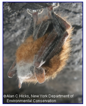
See Bats, page 5

presumptive cause, the cold hardy fungus Geomyces destructans , has spread in recent years throughout the eastern United States and Canada and as far south and west as Oklahoma. Department of Defense (DoD) natural resources managers and biologists are working with their