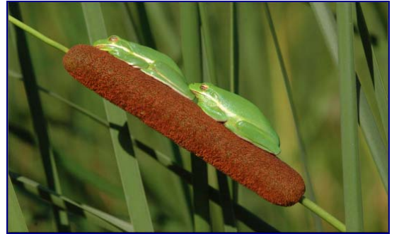
Green Treefrogs ( Hyla cinerea ) resting on cattail ( Typha species ); Photo by Paul Block.

There was a strong spatial component to the data set. The ten eastern temperate installations (Camp Gruber, Fort Leonard Wood, Sparta Training Center, NSA Crane, Fort Knox, Radford Army Ammunitions Plant, Fort A.P. Hill, Fort Belvoir, Fort Lee, and NAS Oceana) had higher rates of Bd infection (18.9%) than the five bases (MCB Camp Pendleton, Camp Navajo, Kirtland AFB, Cannon AFB, and Fort Sill) situated in the arid west (4.8%). There was also a strong temporal (seasonal) component to the data set. In total, 78.5% of all positive samples came in the first (spring/early-summer) sampling period. Data suggest that the spatial pattern of Bd presence is due to variations in moisture levels (with moisture promoting infection rates); whereas, temporal (seasonal) patterns may be due to moisture availability, with Bd present at the highest rates during the wettest times of the year. The authors are preparing a manuscript with additional details and discussion on these findings for submission to a scientific journal.