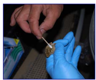
Swabbing a Pine Woods Treefrog ( Hyla femoralis ); Photo by Dr. Joe Mitchell.

A non-invasive protocol for capturing and swabbing amphibians was followed to ensure consistency in data collection and to prevent the transfer of Bd, if present, from one amphibian to another and from one installation to another. Field collected swabs were sent to a qualified lab for detection of Bd where modern methods of PCR reactions were used to test for the molecular "signature" of the disease on all samples.