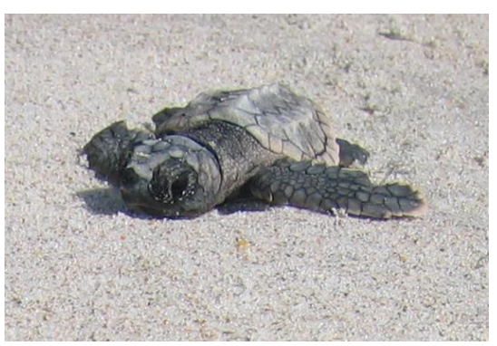
One of six "day-old" threatened loggerhead sea turtle hatchlings was released at the beach on Cape Canaveral Air Force Station by the installation biologist on August 3, 2007. This 2 inch long little fellow was nicknamed Skippy.

Loggerheads! - The loggerhead sea turtle, Caretta caretta, was listed in 1978 as a threatened species and it is considered "vulnerable" by the International Union for the Conservation of Nature. Recent population studies have concluded that the number of females that nest in the Southeast U.S. is continuing to decline. The U.S. Federal government has listed the loggerhead as endangered worldwide. Florida beaches account for one third of the world's total population of loggerheads. The carapace of subadult/adult loggerheads is reddish-brown. Average carapace length is about 92 cm and average body mass about 113 kg. Hatchlings can vary in color from light to dark brown. Flippers are dark brown with white margins. The plastron is the bony plate that forms the underside of a turtle's shell, covering its belly and other under parts has a faded yellow ochre appearance.