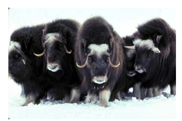
Muskoxen from the Yukon Delta herd, Alaska.

The Muskoxen – The muskox ( Ovibos moschatus ) is called omingmak by Inupiaq-speaking Eskimos meaning "the animal with skin like a beard", a reference to the long guard hair that hangs nearly to the ground. Taxonomists now classify muskoxen with the sheep and goats. The closest living relative of the muskox is the takin, a large goat-like animal which is found in the Himalayas. Muskoxen as a species have changed little since the ice age and are perfectly adapted to live in their harsh arctic environment. The muskox is a stocky, long-haired animal with a slight shoulder hump and a very short tail. Both sexes have horns, but the horns of bulls are larger and heavier than those of cows. The horns of bulls develop large bases which nearly span