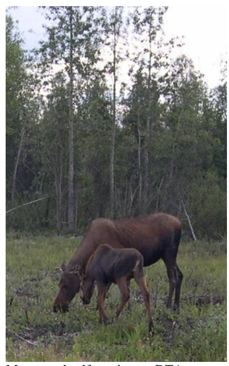
Moose and calf grazing on DTA

Sharp-tailed and ruffed grouse are common on DTA, and USAG Alaska biologist conducts annual surveys to assist with monitoring trends in the populations. The Alaska sharp-tailed grouse ( Tympanuchus phasianellus caurus ) is a unique subspecies which only occurs within the drainages of the Yukon River. Preferred habitat of the Alaska sharp-tailed grouse is the slow growing taiga regions of interior Alaska. Alaska sharp-tailed Grouse are a lekking species and a USAG Alaska staff biologist conducts annual lek surveys which contribute to the Alaska small game report published by the ADF&G. Annual ruffed grouse drumming surveys contribute to ADF&G's annual small game report. Many small game hunters harvest sharp-tailed and ruffed grouse on DTA each year.