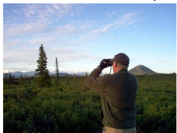
DTA is a popular outdoor recreation, (bird watching, hiking, and camping) site for many Alaskans.

Outdoor recreation is important to many Alaskans, and Army training lands are relatively undeveloped, but close to population centers. Because of this and the fact that Alaska Army lands generally have a better road and trail network than other public lands, they are popular as recreational areas. By working with state and federal agencies to monitor wildlife populations, and to manage sustainable training lands, there will be continued opportunity to enjoy the outdoors on military lands in this great state.