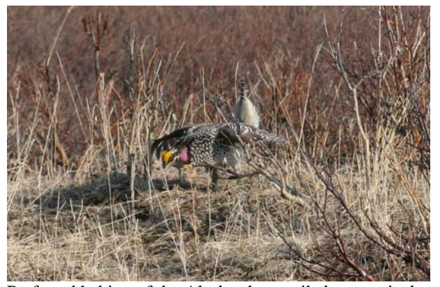
Preferred habitat of the Alaska sharp-tailed grouse is the slow growing taiga regions of interior Alaska. Above a male sharp-tailed grouse is shown at a lek site inside Donnelly Training Area, Alaska.

USFWS determined that Breeding Bird Survey Routes conducted by road were not painting an accurate picture of bird trends in Alaska since most of the state is not accessible by road. A new protocol for monitoring birds in remote areas was needed. The Alaska Landbird Monitoring System (ALMS) protocol was developed by the Alaska Bird Observatory in cooperation with USGS as part of a statewide monitoring plan for birds. This protocol is designed to compliment Breeding Bird Surveys.