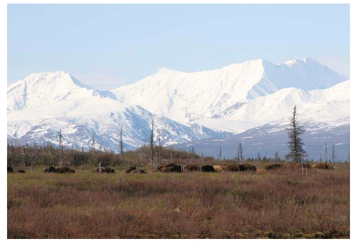
Delta Junction Bison Herd roams free at DTA; adding to the scenery is the Alaska Range in the back.

grouse, sandhill cranes, trumpeter swans, and many other species of waterfowl, shorebirds and landbirds. Hunting, trapping, fishing, bird watching and sightseeing are some of the more common recreational activities on DTA. USAG Alaska biologist work with state and federal agencies to monitor wildlife populations, and to improve habitat for some species.