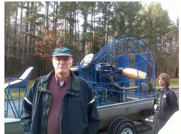
Students inspecting equipment during field trip to Jordan Lake.

Daily field demonstrations offered participants a look into the equipment and methods currently used for invasive species management, giving the class a firsthand look at what does and