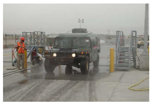
Final washing facility prior to loading for transport.

and well organized. Material and equipment are conveyed to this location prior to the arrival of ships and placed in storage yards after being examined. When the ships arrive, the material and equipment are processed through a final washing facility and then moved onto the ship.