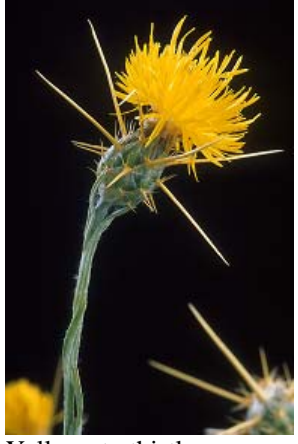
Yellow starthistle, an NIS plant notorious for impacting DoD testing and training areas.

NIS plants in particular present a difficult challenge to the sustainability of DoD's mission, as many currently employed control methodologies (chemical, biological, and mechanical) either are not effective, or are not specific to the NIS of concern and can therefore cause harmful impacts to the native flora and fauna of an area. For over a decade now, the Strategic Environmental Research and Development Program (SERDP) has continued to invest in research and development efforts designed to address critical science and data gaps needed to effectively monitor, control, and prevent NIS plant invasions. This article will showcase two late-stage SERDP projects whose results can be used to advance our knowledge on the control of NIS plants.