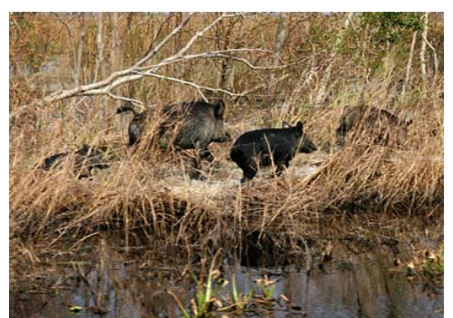
Feral hogs and non-native wild boars cause damage to levees and dikes, uproot vegetation and destroy the habitat of other animals.

Their size and color depend on their breed and the quality of nutrition during development. Feral hogs can reach a size of 3 feet in height, 5 feet in length and more than 400 pounds in weight. However, most sows will average about 110 pounds and boars will weigh an average of 130 pounds. Feral hogs have the capacity to breed at any time of the year when abundant food supplies are available. Sows can begin breeding at six months of age and can potentially produce up to two litters of four to 10 piglets every 12 to 15 months. With this high breeding potential, the population can double in about four months. Feral hogs are also very social animals and tend to travel in family groups consisting of several sows and their offspring. Weaned pigs usually stay with their mother until another litter is born or until they mate. Adult boars are usually solitary, joining the group only to mate or to use a food source.