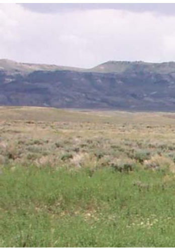
Russian knapweed often forms dense stands in western wildlands and may serve as a selective agent on remnant native plants that survive invasions.

Their examination of native grass Alkalai sacaton ( Soporobolus airoides ) suggests that 'experienced' remnant plant populations exhibit different