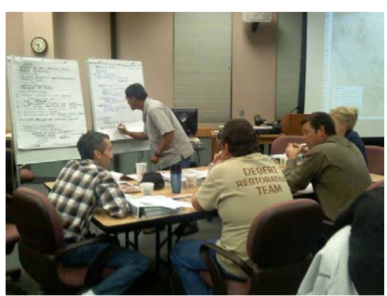
Small working groups tackle assigned problems.

The second day focused on the steps and tools necessary for effective invasive species management. The first session examined early detection, rapid response survey techniques for finding invasive species and prioritizing for management, while the second