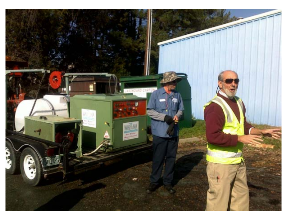
City of Carrboro maintenance crew demonstrate their hot water spray treatment equipment. Through this technology, the city reduces the use of chemicals in all of its maintenance operations.

To find out more about and to utilize resources from this meeting, please go to <u>www.invasiveplantcontrol.com</u>. Click on events and then on the more info tab. From here you can find an abundance of information taken directly from this conference, including presentations, handouts and useful links.