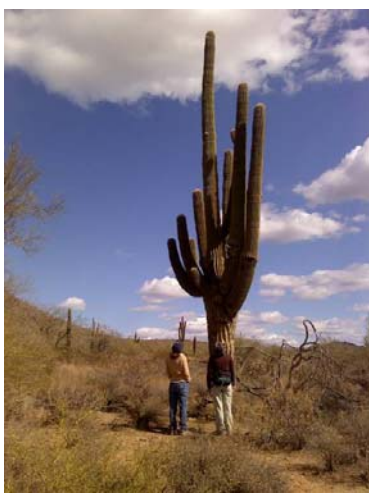
During the field trip, participants marvel at the icon of the Sonoran Desert.

session provided information on specific tools and application methods for management. During an evening session on restoration, DoD natural resources professionals reported on their restoration projects and got feedback from the group.