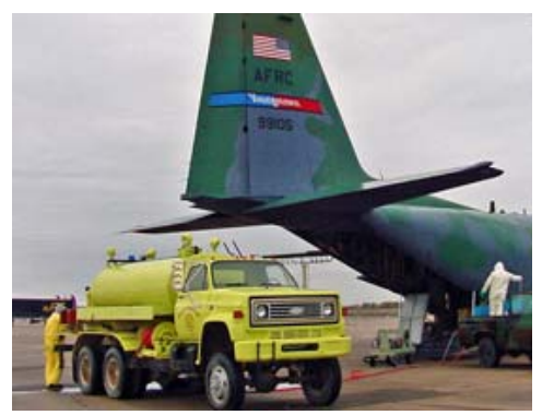
Air Force C-130 aerial spray operations at Smoky Hill Air National Guard Range, Kansas. DoD periodically uses these operations to control extreme outbreaks of the noxious weed musk thistle on the Range.

Many reports have documented the ecological impacts of these non-native invaders, including citing invasive species as one of the greatest threats to biodiversity (e.g., Stein, et al. 2000). Worldwide, an estimated 80 percent of endangered species could suffer losses due to competition with or predation by invasive species (Pimentel, et al. 2005). In addition to direct competitive impacts to native species, some of the worst invasive species are able to alter native habitats and ecosystems. Invasions by non-native species have been shown to modify ecosystem processes, like nutrient cycling, fire frequency, hydrologic cycles, sediment deposition, and erosion (Kelly 2007). On Marine Corps Base Hawai'i, invasive mangrove stands take over native marsh habitats, converting critical habitat for endangered Hawaiian waterbirds into mangrove thickets that are inhospitable to both native species and to realistic military training exercises on base. On Avon Park Air Force Range in Florida, invasive wild hogs compete with the endangered Florida scrub jay for food and destroy nesting habitat for many other endangered species (Westbrook and Ramos 2005). Such feral hogs are a growing menace at several other military installations. When invasive species cause habitat destruction and harm rare native species, the result can lead to reductions in available training lands on installations.