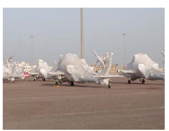
Aircraft prepared at Camp Doha for shipment through the port.

Military Sealift Command, Kuwait: The team visited the military port facilities in Kuwait to examine the final steps in moving material and equipment out of the country. The operations were quite extensive