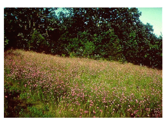
Knapweed invasion. In the western U.S., knapweeds are among the more prevalent NIS plants, occupying over 4.3 million hectares in 14 states and 2 Canadian provinces.

Results to date indicate that the presence of allelochemicals in the soil surrounding some invasive plants is cyclic; in other words, the allelochemicals could be found only at certain times of the year. It is not yet clear if the cyclic presence of the compounds in the soil is due to increased secretion by roots, or because of other factors in the soil that could contribute to the stability of these compounds at certain times. A series of greenhouse studies identified several native plant species that would be superior competitors with allelopathic invasive plants, as well as several native allelopathic species that could be used to compete with invasive plants. These native species were evaluated in field studies at military bases where results have indicated that some of these native species can successfully compete with invasive plants. The research team is working on follow-up studies to refine these findings for field applications.