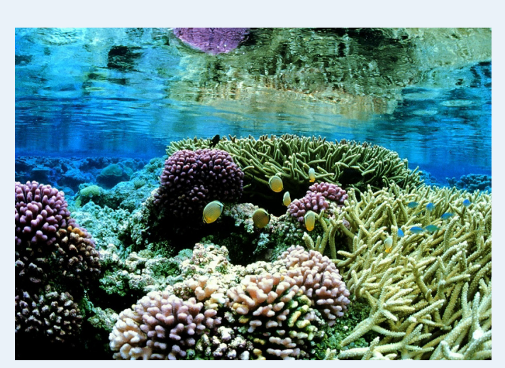
The pink coral gardens of Palmyra Atoll in the Pacific Ocean abound with tropical fish.

DoD Instruction 4715.03, Natural Resources Conservation Program, directs DoD to inventory biologically or geographically significant or sensitive natural resources on its properties. Information for these inventories is necessary to prepare INRMPs which are required by the Sikes Act. Establishing baseline data is the foundation of any assessment program, and will support the mapping and inventory initiative of all U.S. coral reef ecosystems. The Legacy Resource Management Program funded DoD Coral Reef Initiative Database, which helps identify sensitive coral reef species and their critical habitats, and provides the latest information on threats and assessment techniques. It helps define which laws pertain directly to the reefs under DoD stewardship and how DoD responsibilities overlap with