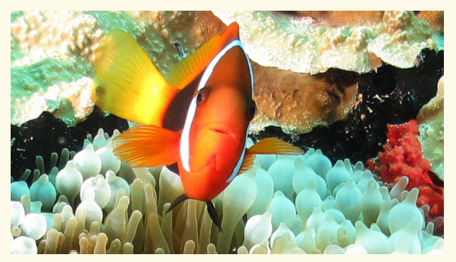
A tomato clownfish (Amphiprion frenatus) defends its territory in a bubble tip anemone (Entacmaea quadricolor) on a coral reef in Apra Harbor, Guam.

With 95% of the oceans still unexplored, there is much we do not yet know about this vast resource and all it contains. Nevertheless, we strive to learn and make use of that knowledge to inform our actions. Towards that end, I hope you will find this edition of Natural Selections enjoyable and informative.