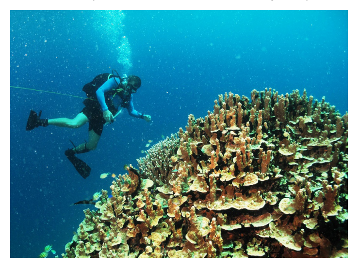
An active duty Navy diver supports measurement of a large coral colony (Porities rus) located in Apra Harbor, Guam during a natural resources survey in August 2017.

In July of 2017, the Naval Base Guam (NBG) Environmental Office coordinated with Andersen AFB, to assess aquatic natural resources for Joint Region Marianas. Combined military-civilian dive teams completed over 20 hours of dive surveys in Apra