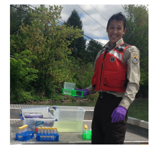
An aquatic invasive species crew member takes environmental DNA samples out in the field. Environmental DNA uses genetics to look for invasive species in water samples.

monitoring due to the difficulty of thoroughly surveying aquatic environments. An efficient alternative to traditional field surveys is the use of eDNA to detect species presence. The project team developed and validated eDNA sampling protocols for a variety of aquatic species, including frogs, salamanders, fish, and diseasecausing pathogens. Techniques used during this demonstration are helping inform ongoing natural resource management activities, including development of species-specific endangered species management plans, ESA