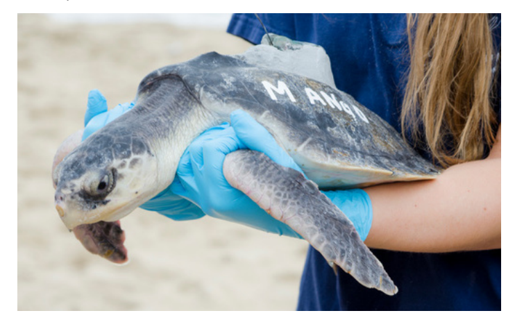
DoD researchers fitted this turtle, "Mango Tango," with a small satellite tag. It can now be tracked on seaturtle.org.

The Virginia Aquarium & Marine Science Foundation (VAQF) is working with NAVFAC Atlantic and U.S. Fleet Forces Command (USFF) to track young loggerhead, Kemp's ridley, and green sea turtles, using a combination of satellite and acoustic transmitters. To date, this USFF-funded effort has fitted 43 satellite transmitters and 72 Vemco<sup>™</sup> acoustic tags on sea turtles in Virginia waters. The satellite tags transmit locations to a satellite that returns thousands of locations. The acoustic tags emit a signal that is recorded by a receiver as the sea turtle swims past it.