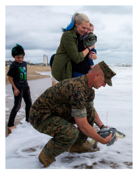
After a recreational angler hooked this turtle, "Purple Heart," researchers outfitted it with a satellite tag and a PIT tag in its front flipper. A two-time Purple Heart recipient and his family released the turtle in June 2017.

facilities, bases, vessels, shipyards, and in-water training areas. Sea turtles in the area are all listed as threatened or endangered, and can be impacted by human activities including recreational fishing, boat traffic, dredging, pile driving, and other activities that create noise and affect the underwater landscape. Understanding the location and behavior of sea turtles near these activities is vital to limiting potentially harmful interactions. Currently, our understanding of sea turtle movement and habitat use in the