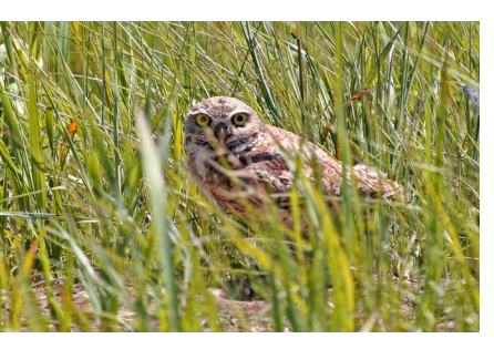
The burrowing owl only stands 9-11 inches tall and lives in underground burrows.

This project determined the migratory habits and wintering grounds of the burrowing owl, an endangered species found on several western DoD installations. The project team worked with over 20 partners in the