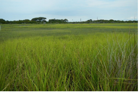
Black needlerush (Juncus roemerianus) is the predominant marsh plant in the estuary that prefers brackish water conditions (left), while smooth cordgrass (Spartina alterniflora) prefers more saline waters along the Intracoastal Waterway (right).

from the mainland of MCBCL. DCERP researchers found that current military training activities have little impact on the salt marshes; however, the effects of sea level rise on estuarine salinity are altering marsh structure and function. These wetlands capture sediment from the watershed, remove