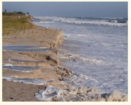
Wave action causes significant beach erosion along southern Onslow Beach near MCBCL.

stressing the plants and animals that live in these systems. And even though our love of coastal areas may mean that 70% of us end up living within 100 miles of a coast by 2070, all is not doom and gloom: marine systems