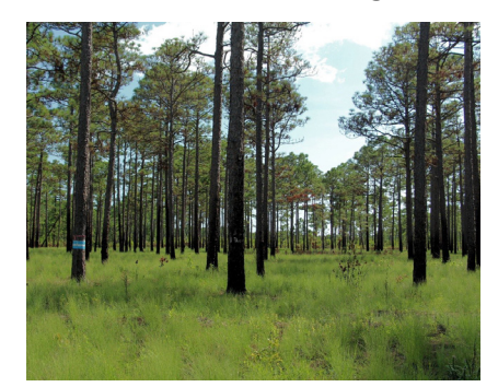
Longleaf pine forests of MCBCL provide habitat for endangered species like the red cockaded woodpecker, training land for the military, and carbon storage.

pine habitat was restored. Restoration efforts also support the overall wildlife community and plant diversity of the forest. Longleaf pine (Pinus palustris) savannas and flatwoods once dominated upland terrestrial ecosystems across the southeastern U.S., including MCBCL. Today, longleaf pine savannas are intact habitat for realistic testing and training