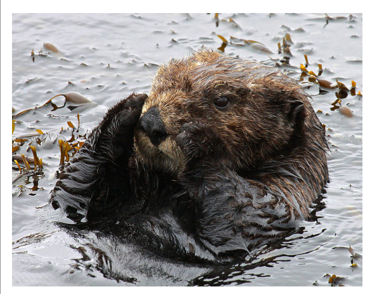
A southern sea otter settles down to rest in a small patch of feather boa kelp (Egregia).

Thirty years ago, the Navy joined forces with USFWS to help recover California's southern sea otter ( Enhydra lutris ). Decades of collaboration and shared research have resulted in a better overall understanding of the positive effects sea otters have on the nearshore marine ecosystem without compromising the Navy's ability to conduct essential national defense activities in southern California.