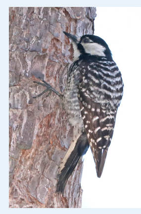
Red-cockaded woodpecker.

Through case studies, course participants learn strategies for facilitating regulator and stakeholder cooperation while protecting natural resources in ways that ensure no net loss in mission capability. Specific case studies include red-cockaded woodpecker management on Army lands, a USFWS consultation for U.S. Marine Corps build-up on Guam and the Mariana Islands, and Air Force coordination with a USFWS liaison to manage forest structure and expand redcockaded woodpecker colonies.