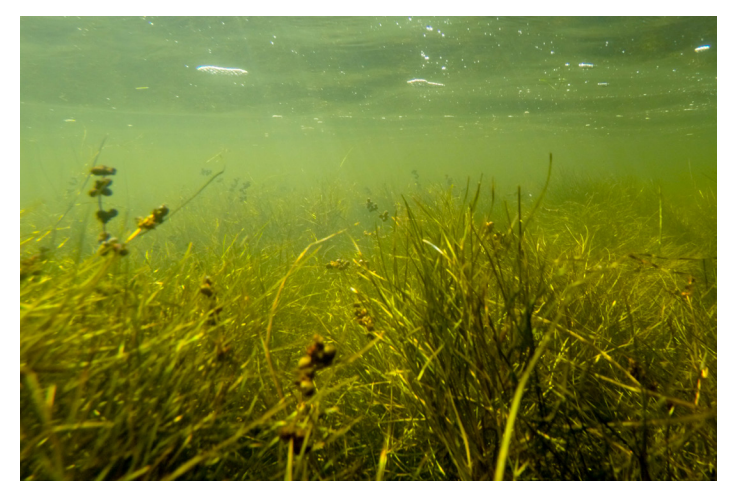
SAV in the Severn River Sanctuary in Anne Arundel County, Md.

Many installations across all Military Services have supported efforts over the past 20 years to restore SAV beds along the shores of DoD property. These efforts include the planting of SAV beds in the Chesapeake and the development of coated SAV seeds to improve germination rates. These efforts began in the 1990s and have achieved mixed results. For example,