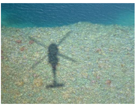
Aerial photo taken over a shallow reef flat in Apra Harbor, Guam, from a Navy MH-60S helicopter assigned to HSC-25 'Island Knights' in August 2017.

EODMU5 provided a platoon of divers to determine the condition of corals at Western Shoals. while other divers completed unmanned underwater vehicle operations, which were essential to getting images of areas within the Inner Apra Harbor where water visibility was too low for a traditional visual