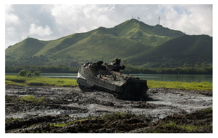
U.S. Marines team with the base environmental office each year to tear up the mud within the Nuupia Pond Wildlife Management Area and wetlands at Marine Corps Base Hawaii to help preserve the living conditions of wildlife in the areas.

This project identified DoD installations that provide optimal habitat for several wetland-dependent bird species to ensure that population declines do not curtail the military mission and reduce readiness, and to enable DoD to better manage wetland-dependent bird habitat. Researchers used field sampling data collected from 1999-2012 to develop habitat models that predict the distribution of 10 species of secretive marsh birds within DoD installations across the continental U.S. Researchers then used these models to rank important DoD installations for these species based on their wetland habitat. This work represents a vital first step towards identifying, predicting, and ultimately conserving the most valuable wetland habitats on DoD installations for a suite of wetland-dependent birds, and therefore a step toward proactive management of these species.