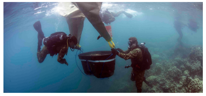
Explosive ordnance disposal technicians assigned to EODMU-5 help repair a damaged coral reef in Apra Harbor.

survey. In addition to the underwater surveys, MH-60S Seahawk helicopters from HSC-25 "Island Knights" completed the first rapid aerial coral bleaching photographic survey of the reefs where the depth of water was too shallow for diving.