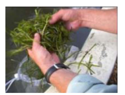
Sampling SAV populations provides critical information for installation natural resource managers.

waterfowl. In addition, grass beds contribute to the overall health of the Chesapeake Bay by absorbing nutrients, adding oxygen to the water, and protecting the coast by filtering sediment and dissipating waves. For all these reasons, many DoD installations in the Chesapeake region have a keen interest in managing this habitat under their jurisdiction. Installations along the Chesapeake Bay