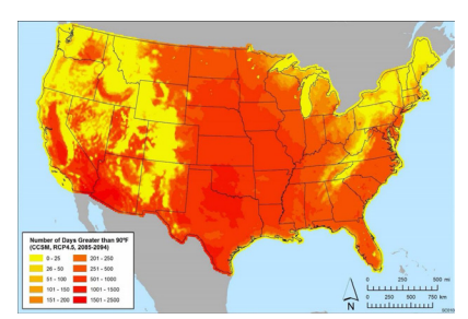
Image showing number of days greater than 90°F from SERDP RC-2205.

the annual monsoon in Southwestern U.S. These changes threaten infrastructure and operational capabilities on many DoD installations in the region. This project produced a robust methodology to determined how warm season extreme weather events in the