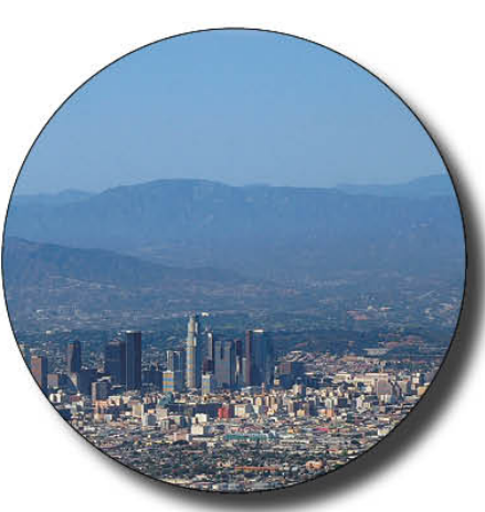
Combined area of California, Texas and Florida

National Park SystemNational Forest System84 million acres188 million acres