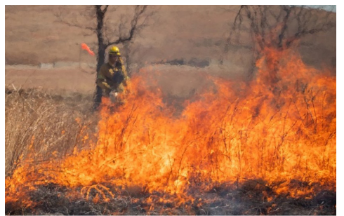
A Fort Sill firefighter watches a prescribed burn near the West Range on March 15, 2022.

The highest policy and legislative decision makers recognize the impacts of wildfire. This recognition has led to a demand for focused, collaborative assessment and reporting on fire management challenges and opportunities. It has also resulted in a surge of funding capacity dedicated to wildfire risk mitigation and firefighter recruitment, retention, and well-being through the Bipartisan Infrastructure Law for the U.S. Department of Agriculture (USDA), U.S. Forest Service (USFS), and U.S. Department of the Interior (DOI). These agencies own the preponderance of federally managed lands and fire management capabilities.