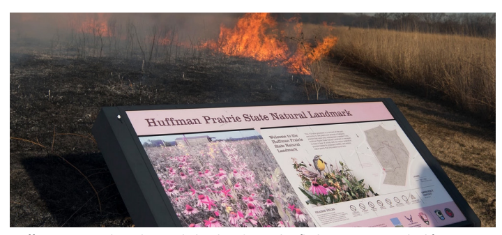
Huffman Prairie, where the Wright brothers learned to fly, burns in a prescribed fire conducted by Wright-Patterson Air Force Base, Ohio, to help the prairie grass thrive and discourage woody vegetation on February 21, 2020.

Operationally, there are challenges to adopting NWCG standards and ensuring a continuous stream of qualified and experienced wildland fire personnel to meet the increasing wildland fire challenges. Many NWCG qualification standards require personnel to be evaluated as a trainee on a wildfire incident before becoming fully qualified. Most DoD personnel, whether Natural Resources Managers, or Fire and Emergency Services, have limited ability to participate in cross jurisdictional wildfire incidents outside of an installation. This is where the NWCG's Incident Performance and Training Modernization (IPTM) effort become critical to DoD's qualification process. With IPTM, NWCG is working to streamline the personnel qualification process while still ensuring individuals have developed the knowledge, skills, and abilities they will need in an assigned role.