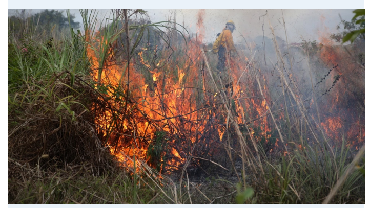
A controlled burn is conducted during wildfire investigation training hosted by Guam Department of Agriculture, also helping in the eradication process of an invasive plant species in the future Marine Corps Base Camp Blaz forest enhancement area in Dededo, Guam on March 1, 2020.

Click here to see the full NISC-WFLC memo: nisc-wflcmemofinal-10-12-2022.pdf (doi.gov).