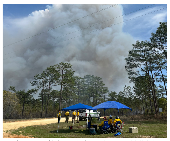
Research staging area and the burn's smoke plume at Eglin AFB, in March 2023.

Through the launch of EILNP and other regional hubs, the Innovation Landscapes Network seeks to collaborate across the federal government to increase the relevance and pace of innovation in conservation management, reduce duplicative efforts, and develop and transfer new technologies across the federal landscape portfolio. This initiative is coordinating with existing landscape-scale partnerships and represents an opportunity to align with federal priorities and agency missions to confront threats to mission sustainment such as climate change and the nation's wildfire crisis. The partnership(s) will invest in deliberate efforts to accelerate technology transfer for science and modeling at a landscape level and provide proof of concept and scalability across ownership boundaries and jurisdictions to support collective landscape stewardship opportunities.