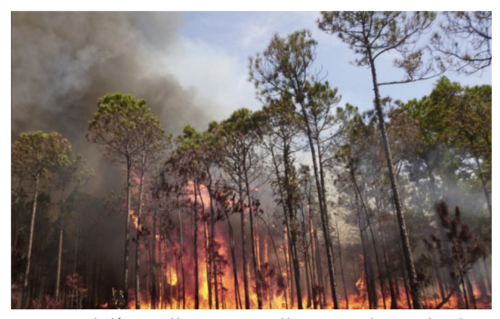
A spring prescribed fire ignited by AFWFB personnel burns in a mixed pine stand at Eglin AFB in April 2022.

DoD's recognition of wildland fire as both a critical ecosystem management tool and a source of potential negative impact to military missions and surrounding communities resulted in an increased focus on wildland fire management in recent years. The Air Force and Space Force complete wildland fire management through the Air Force Civil Engineer Center's (AFCEC) Wildland Fire Branch (CZOF). The Branch is operated in an interagency manner, through partnerships with USFWS, the Bureau of Land Management, and university partners to give the Air Force access to a dedicated staff and, as needed, nationally trained and qualified personnel to implement prescribed fire and mechanical fuels management projects across the Air Force and Space Force. The Wildland Fire Branch has three regions and 14 Wildland Support Modules (WSM)—each of which has an Area of Responsibility (AOR) with multiple installations. WSMs complete projects within their AOR and bring decades of experience and qualifications in meeting NWCG standards.