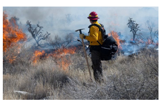
Firefighters from the Air Force Civil Engineer Center's Wildland Fire Branch, along with a specialized team of fire experts from the U.S. Fish and Wildlife Service, U.S. Forest Service, Albuquerque Fire Department, and others, came together to execute a series of prescribed burns at Kirtland Air Force Base on March 9, 2023.

DoD's landscapes exhibit some of the most diverse and unique ecosystem and species associations and most extensive cultural resource collections found in the United States. DoD's dedicated land, wildlife, and cultural resource managers guide the Department to these stewardship successes. Additionally, DoD natural and cultural resource managers have become adept in adaptation and innovation to incorporate the disturbance regime and land use demands that are unique to military testing and training. With an average of 1 million acres that burn due to wildfire or prescribed fire on military