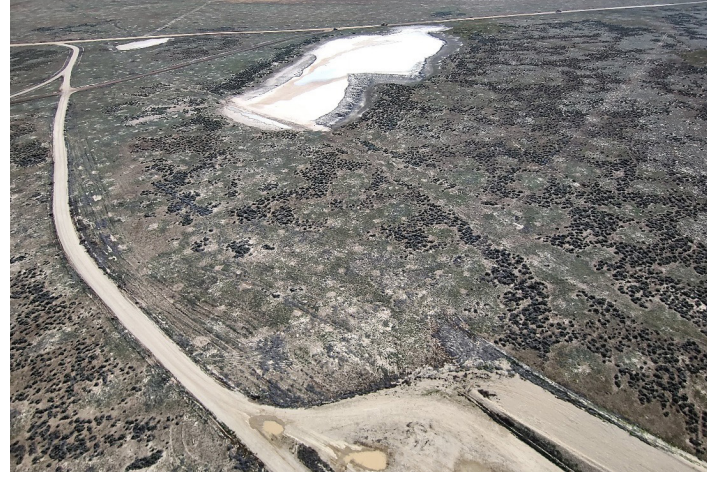
Aerial imagery of a cultural site on the OCTC, taken from a UAV.

Effectively mitigating the effects of wildfires on cultural resources will require collaboration with the Fire Management Unit and other environmental personnel, as well as ongoing evaluations of individual sites. Having these practices in place before intense fires occur puts the IDARNG in a better position to protect the integrity of these invaluable resources.