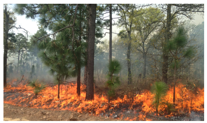
A prescribed fire in a longleaf pine stand at the Poinsett Electronic Combat Range in Winter 2016

To read NFWF's full press release, click here.