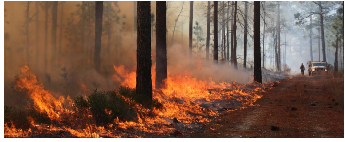
The beginning stages of a prescribed burn as the wind guides it, causing it to grow larger in the LE training area, Marine Corps Base Camp Lejeune on January 30, 2023.

Working in these challenging areas is a way to begin mitigating the potential wildfire effects inside and outside installation boundaries. The more we focus on mitigating impacts on the installation, in the local community, to training, to habitat, and to infrastructure, the more our wildfire resilience will increase and support the Department's core missions. Wildfire mitigation requires long-term planning and commitment to ensure resilience for future fires, not just the fire burning on the horizon. As such, one of CMAT's principal concerns before deploying