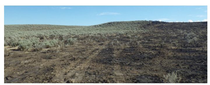
Post fire near Christmas Mountain on the OCTC.

Fire management activities and surface alterations made by fires can also have negative impacts on cultural resources. Increased ground visibility after a fire makes artifacts more vulnerable to looting. Large equipment used in fire management, like dozers and graders, cause significantly more ground disturbance than hand crews and are more likely to displace or destroy materials. Some artifacts may also be damaged by rapid cooling from water, fire retardants, and chemical products.