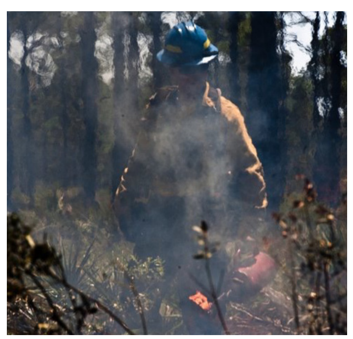
A prescribed fire crewmember from the Eglin Natural Resource Department lights a controlled fire at a range located on Hurlburt Field, Florida, April 20, 2012.

Did we miss an opportunity to tell a wildland fire story, address a challenge, or clarify a topic? We would love to hear more. Contact us at: osd.wildland-fire-mgmt@mail.mil