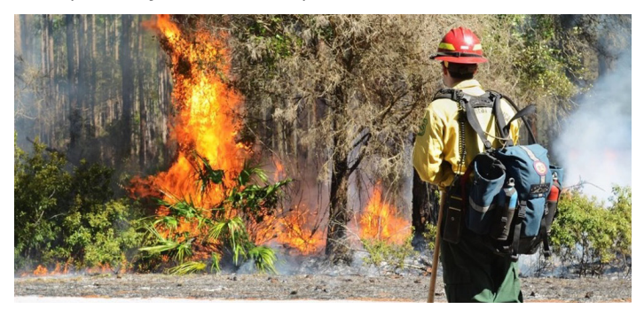
A U.S. Forest Service firefighter monitors a prescribed burn at Naval Submarine Base Kings Bay, March 1, 2023.

DoD recently joined NWCG to support workforce development and increase access to standardized training, partner interoperability, and personnel qualifications. Membership enables a common approach to fire management standards and supports the goals of the National Cohesive Strategy. In turn, DoD provides subject-matter expertise and direct support for the training and operational standards and guidelines developed and maintained by NWCG. NWCG staff members graciously contributed to this issue to outline its current priority actions focused on modernizing wildfire response strategy and workforce development. Additionally, Marine Corps Installations West shows how it has moved from applying standards to internal operations and evolved to true, extensive, multi-partner interoperability through a fire school hosted at Camp Pendleton. These articles convey the shifting strategy for large-scale incident management, workforce development, and increased interoperability for wildfire response.