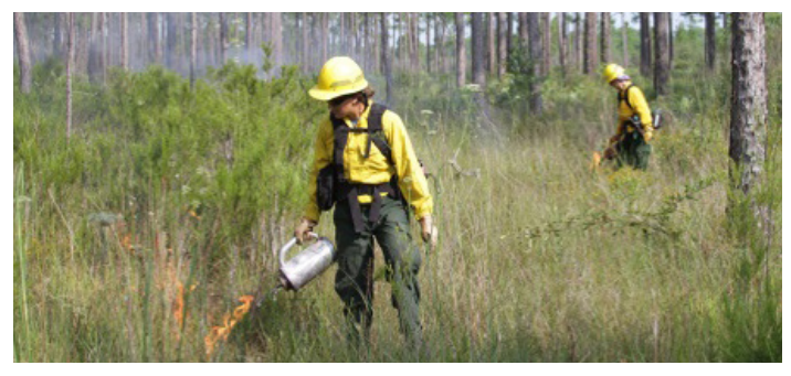
AFWFB firefighters ignite a spring prescribed burn at Eglin AFB in April 2022.

Installation wildland fire management begins through collaboration to identify a need for prescribed fire or mechanical fuels work for the protection of built and natural infrastructure. In addition to Integrated Natural Resource Management Plans (INRMP), a Wildland Fire Management Plan (WFMP) is prepared to look at installation-specific conditions. The WFMP identifies fire management objectives to protect built and natural infrastructure and outlines roles and responsibilities between the Wildland Fire Branch and the installationincluding installation leadership, the Natural Resource Program, and Fire and Emergency Services (F&ES). From here, individual projects are planned and completed, most commonly through prescribed fire and/or mechanical fuels management, which reduces fuels (vegetation) within a unit to alter fire behavior if there were to be a fire. Prescribed fire is the preferred method of treatment since it is more cost-effective on a landscape scale and best replicates natural ecosystem processes. Prescribed fires are generally combined with mechanical fuels reduction at key control points to reduce fire behavior. Prescribed fire is not always appropriate due to individual project locations and conditions. Mechanical fuels reduction is used when fuels are too heavy to burn, in locations or ecosystems that would have adverse impacts if burned, or in urban or other sensitive areas where smoke impacts cannot be mitigated.