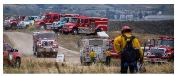
Firefighters from many Southern California firefighting agencies participate in the annual Wildland Fire School on Marine Corps Base Camp Pendleton, California on June 3, 2019.

MCIWEST provides direct support to Marine Corps Base Camp Pendleton, MCAS Pendleton, MCAS Miramar, Marine Corps Logistics Base Barstow, MCAS Yuma (including the Chocolate Mountain Aerial Gunnery Range and Barry M. Goldwater Range West), Marine Corps Air Ground Combat Center 29 Palms, Marine Corps Mountain Warfare Training Center Bridgeport, and Marine Corps Recruit Depot San Diego. Each of these installations has a unique mission and unique wildland fire requirements.