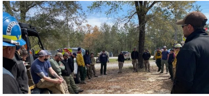
Morning briefing for a prescribed fire/research burn at Eglin AFB, in March 2023.

Through the launch of EILNP and other regional hubs, the Innovation Landscapes Network seeks to collaborate across the federal government to increase the relevance and pace of innovation in conservation management, reduce duplicative efforts, and develop and transfer new technologies across the federal landscape portfolio. This initiative is coordinating with existing landscape-scale partnerships and represents an opportunity to align with federal priorities and agency missions to confront threats to mission sustainment such as climate change and the nation's wildfire crisis. The partnership(s) will invest in deliberate efforts to accelerate technology transfer for science and modeling at a landscape level and provide proof of concept and scalability across ownership boundaries and jurisdictions to support collective landscape stewardship opportunities.