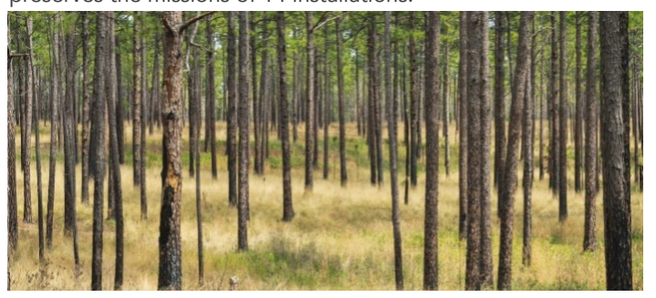
Grassy groundcover becomes dominant in a frequently burned longleaf pine plantation at Fort Liberty, North Carolina.

terrain and cover for military training and operations and acting as a buffer against incompatible development. When managed through prescribed burning, longleaf pine habitat provides a climate-resilient forest type for installations. Additionally, through its REPI program, DoD established partnerships with the America's Longleaf Restoration Initiative (ALRI), a coalition devoted to restoring longleaf pine forest, and the Longleaf Landscape Stewardship Fund (LLSF), a public-private partnership to expand, enhance, and accelerate longleaf pine restoration across its historic range. Through the efforts of the ALRI partnership, more than 1.6 million acres of new longleaf stands have been planted and millions of acres of existing longleaf forests are now managed with prescribed fire. The LLSF, meanwhile, leveraged over $7.4 million in DoD funds to protect and manage longleaf forests across the historic range. By partnering with these organizations, DoD supports and preserves the missions of 14 installations.