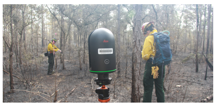
Fuel sampling and terrestrial lidar scanning of a research plot at Eglin AFB after a prescribed burn in March 2023.

Wildland fire science is fundamental to all aspects of successful fire management and, as such, the WFSI and EILNP augment DoD and other agencies' current wildland fire science efforts and management capabilities to support fire adapted communities; resilient landscapes; safe, and effective wildland fire management; and enhanced interoperability.