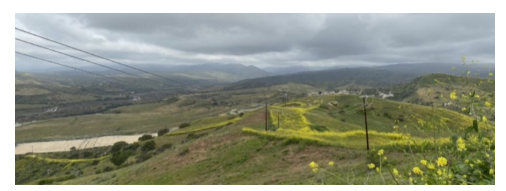
Mustard flowers highlight firebreaks along ridgelines at Marine Corps Base Camp Pendleton in April 2023.

This level of wildland fire interoperability is not limited to external agencies during large-scale exercises or incident response. The entire wildland fire program is founded on the integration of internal Marine Corps offices with a wide range of staffing from environmental, facilities, operations and training. and fire and emergency services. By leveraging qualified individuals throughout MCIWEST, we accomplish a mission that spans local department and installation boundaries to manage military lands, respond to wildland fire, and, above all, maintain warfighter readiness.