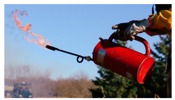
Camp Ripley Environmental Team sets fire to natural vegetation during a prescribed burn on November 3, 2020, near the amphitheater and prairie restoration area on Camp Ripley, Minnesota.

installation resilience. This commitment aligns with the Defense Climate Adaptation Plan, which identified wildfire as a mission threat and will be formalized through DoD's own Cohesive Strategy, mirroring the concepts and key tenets of the National Cohesive Strategy within our own Lines of Effort (LOE). The DoD Cohesive Strategy will translate into implementation plans for sound wildland fire management supporting and protecting installations, military mission values, and our surrounding Defense Community.