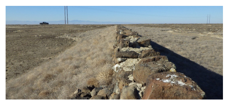
Buildup of hazardous fuels around a historic dam.

Low-intensity, short-lived fires may cause cosmetic damage to artifacts, but hotter, longer-burning fires have the potential to cause extensive damage and data loss. Stone tools, pottery, and glass may experience breakage, spalling, crazing, pitting, smudging, and discoloration. The solder and labels on late 19thand early 20th-century cans can be destroyed. Organic materials