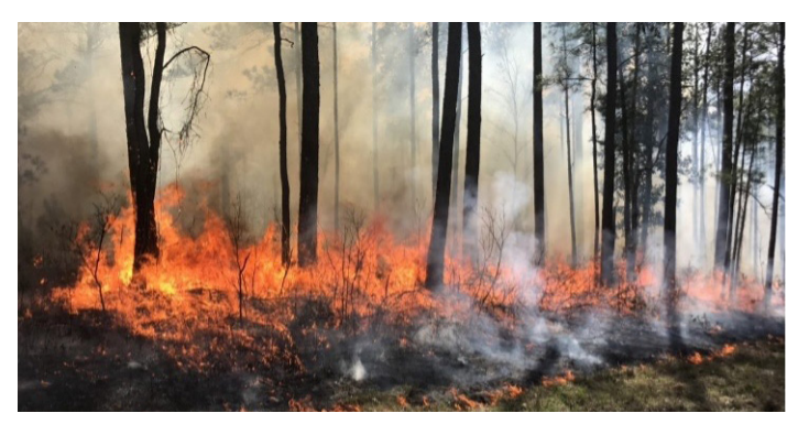
Prescribed fire burning in a mixed pine stand at Joint Base Charleston South Carolina's Naval Weapons Station 2015.

Although longleaf pine (Pinus palustris) was once the dominant forest type in the Southeast United States, conversion to other land uses or forest types reduced total longleaf pine forests from a historic 90-million-acre range to fewer than 3 million acres by the 1990s. These native longleaf pine forests are well adapted to the frequent low-intensity fires that occur naturally from lightning strikes across their range as well as from application of fire by Native Americans starting roughly 10,000 years ago. This regular fire regime prevented the buildup of ground level fuels and midstory density, which would otherwise increase the risk of catastrophic wildfires. With climate change expected to result in more frequent and extended droughts, the likelihood of catastrophic wildfires will increase and can be exacerbated when forest types are not as fire adapted, leading to greater risk of severe property damage and loss of life.