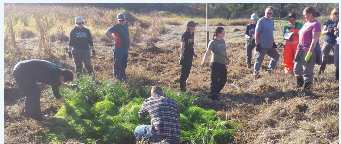
JBLM volunteers assist with an experimental wetland revegetation project.

At Joint Base Lewis-McChord (JBLM), a CESU Network cooperative agreement strengthens mission readiness by sustaining training lands, supporting timber harvest, and finding cooperative solutions to environmental compliance challenges. Additionally, the agreement fosters job training and education to service members, veterans, and military spouses through JBLM's internship program. This program has yielded over 115,000 volunteer hours (equivalent to $4.6M in labor) since 2014, benefiting the installation and equipping participants with skills and certifications in firefighting, pest management, biological surveys, and forestry. Through this program, servicemembers obtain valuable skills and unique access to universities and colleges so they can further their education and career goals after their service ends. The CESU cooperative agreement at JBLM creates a win-win-win for the mission, our servicemembers, and long-term land stewardship.