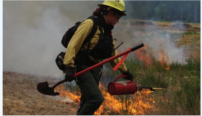
JBLM firefighting intern helps maintain critical training lands with a controlled burn.

At Joint Base Lewis-McChord (JBLM), a CESU Network cooperative agreement strengthens mission readiness by sustaining training lands, supporting timber harvest, and finding cooperative solutions to environmental compliance challenges. Additionally, the agreement fosters job training and education to service members, veterans, and military spouses through JBLM's internship program. This program has yielded over 115,000 volunteer hours (equivalent to $4.6M in labor) since 2014, benefiting the installation and equipping participants with skills and certifications in firefighting, pest management, biological surveys, and forestry. Through this program, servicemembers obtain valuable skills and unique access to universities and colleges so they can further their education and career goals after their service ends. The CESU cooperative agreement at JBLM creates a win-win-win for the mission, our servicemembers, and long-term land stewardship.