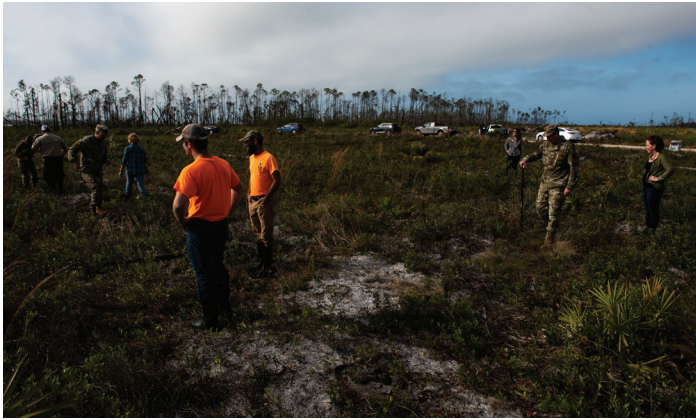
Airmen, their spouses, and civilian partners planted longleaf pine trees at Tyndall Air Force Base, Florida, Jan. 15, 2020. The 325th Civil Engineer Squadron natural resources section, and contracted partners planted longleaf pine trees along Highway 98 near Fire Station 4 at Silver Flag Road.

The Office of the Assistant Secretary of War for Energy, Installations, and Environment (OASW(EI&E)) maintains a Memorandum of Agreement (MOA) with the U.S. Army Corps of Engineers (USACE) to ensure the Military Services have access to a contracting office to execute CESU agreements. Naval Facilities Engineering Systems Command (NAVFAC) regional offices also execute agreements for the Navy and Marine Corps via the CESU Network, enabling tailored support for operational readiness and strategic installation priorities across the Military Services.