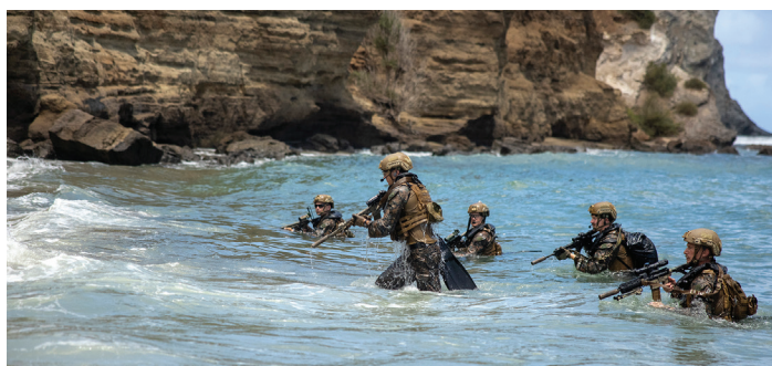
Marines assigned to the 3rd Reconnaissance Battalion conduct a water insertion during Pololu Strike at Marine Corps Base Hawaii.