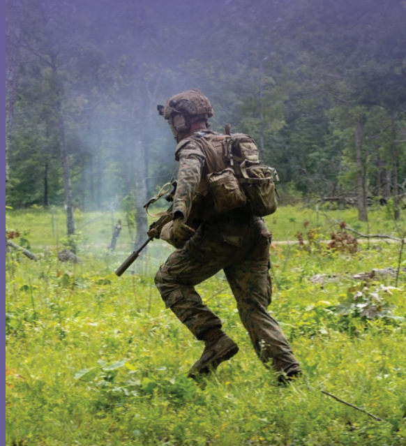
3rd Battalion, 1st Marines maneuver during the Rifle Squad Competition at Marine Corps Base Quantico, Virginia.

REPI The Readiness and Environmental Protection Integration (REPI) Program supports cost-sharing agreements between the Military Services, other Federal agencies, state and local governments, and private organizations to avoid land use conflicts near military installations, address environmental restrictions that limit military activities, and increase military installation resilience.