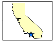
Figure 1-1 General JFTB Los Alamitos Location