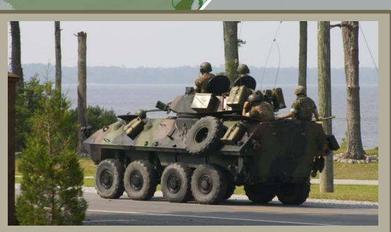
Marine Corps Base Camp Lejeune Among other combat units and support commands, Camp Lejeune's 156,000 acres houses the II Marine Expeditionary Force, the 2nd Marine Division, and the 2nd Marine Logistics Group. Eleven miles of beach are available to support amphibious operations.

Marine Corps Air Station New River As the only East Coast rotary wing installation, New River and tenant commands are vital in the training, readiness and deployment of worldwide Marine Corps aviation forces. With over 3,600 acres, New River houses over 6,000 Marines, Sailors, and civilians, CH-53E "Super Stallions," CH-46 "Sea Knights," MV-22 "Ospreys," UH-1N "Hueys," and AH-1W "Super Cobras."