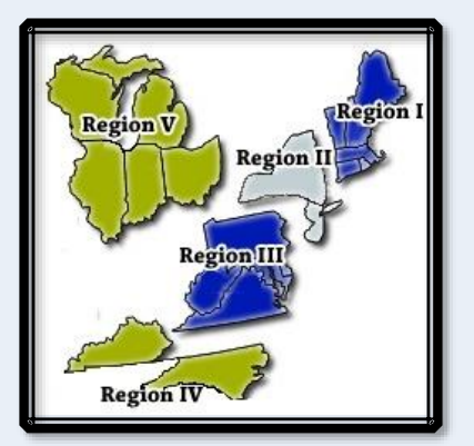
NAVFAC MIDLANT DOD REC Map

To find out more about the Regional EnvironmentadFFICE OF PREPUB Coordination (REC) Office and browse back issues of the REC Review visit http://denix.osd.mil/rec/home/. To receive a copy of this electronic publication, send a subscription request to angela.s.jones1@navy.mil.