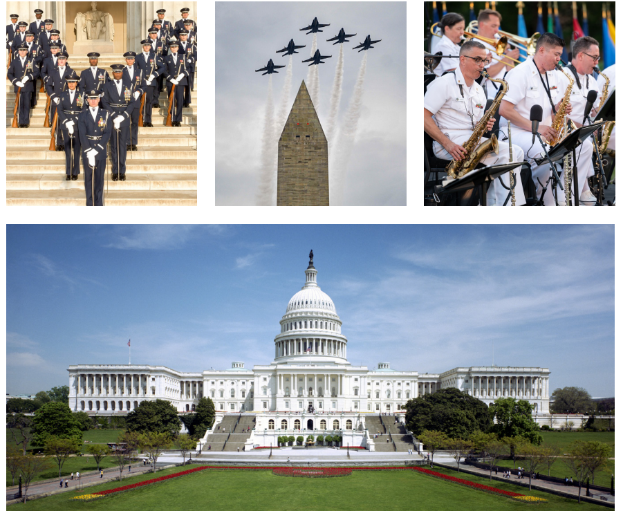
All photographs included in this brochure are from U.S. Government sources.

Through the REC program, DoD and military service representatives partner with state agencies and governments to strengthen environmental restoration and protection efforts and to promote long-term sustainability of the military mission. Program efforts include educating state agencies and officials about the military's operational and environmental needs, priorities, and concerns; communicating coordinated DoD positions on issues affecting military sustainment; and engaging in state legislative and rulemaking initiatives.