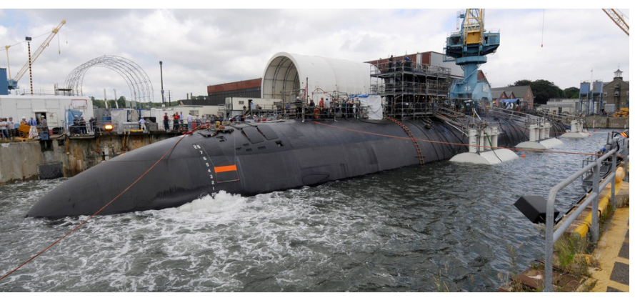
All photographs included in this brochure are from U.S. Government sources.