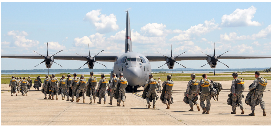
All photographs included in this brochure are from U.S. Government sources.